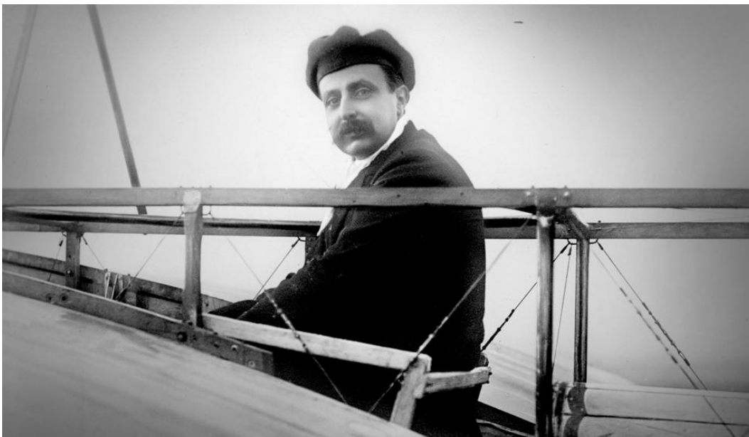
Louis J. Ch. Blériot (1872-1936) before the 1909 English Channel crossing