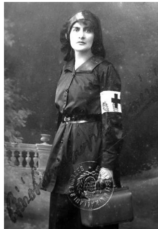
Karola Szilvássy during the First World War