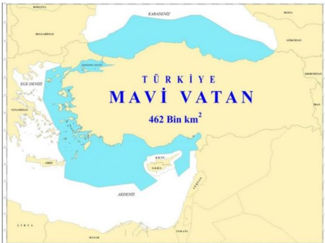
Figure 2: Blue Homeland: Turkey's expanding naval horizons in Mavi Vatan

this effort is now visible not only on land (e.g. Syria, Libya) but also at sea (Mediterranean). The advocacy strategy is that Turkey has spent significant financial resources in recent years on building a strong navy. According to Turkish plans, a total of 24 new ships will be completed by 2023, including four frigates. The expansive direction is also reflected in the concepts of Turkish foreign policy, according to which the Turkish Homeland (vatan) is not meant exclusively for the mainland (Anatolia), but also for the Blue Homeland, i.e. the seas (mavi vatan). The term was first used by Admiral Ramazan Cem Gürdeniz in 2006 (Gürdeniz, 2018), while in geopolitics the term was used from March 2019 after a naval exercise. Between 27 February and 8 March 2019, the largest naval exercise in the modern history of Turkey was held under the name “Mavi Vatan”. The operation in the Black Sea, the Aegean Sea and the Mediterranean involved 103 warships, submarines, and other ships, as well as drones. All of this symbolically marked the expanding direction of Turkish foreign policy towards the “blue homeland,” that is, the seas (Tsiplacos, 2019, p. 6).