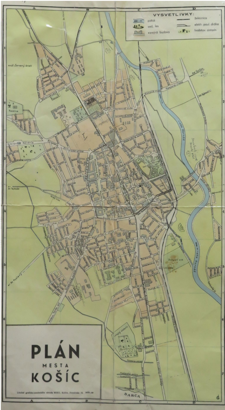
City plan of Košice at the end of the first phase of its territorial development in 1959.