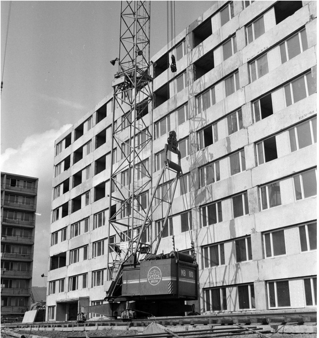
The construction of the residential area called Košice-West. On the left, it is block no. 4-14 of Trieda SNP (1964).

over in two districts of Košice – mesto [Košice – city] and Košice – vidiek [Košice – countryside]. It seemed that the issue of the industrial area of the ironworks was definitely resolved during the annexation of villages in 1976.