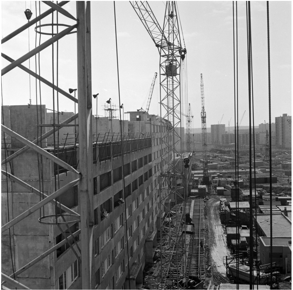
The construction of the residential area called Košice-West. On the right, it is block no. 14-18 in ulica Ipeľská (1964).