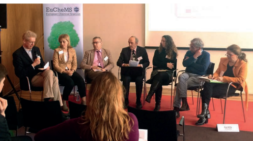
The workshop "Science: How close to open?" took place in Amsterdam on 5 April.

On the occasion of the Open Science Conference organised by the Dutch presidency of the Council of the EU, EuCheMS organised the workshop "Science: How close to open?" which took place in Amsterdam on 5 April.