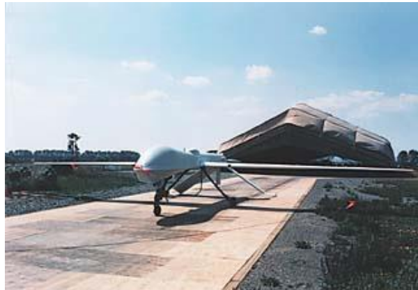
Figure 5. A Predator UAV in Taszár, Hungary, during the Yugoslav War

turned out that drones can be used in many ways in almost every combat theatre, and they are extremely effective [13].