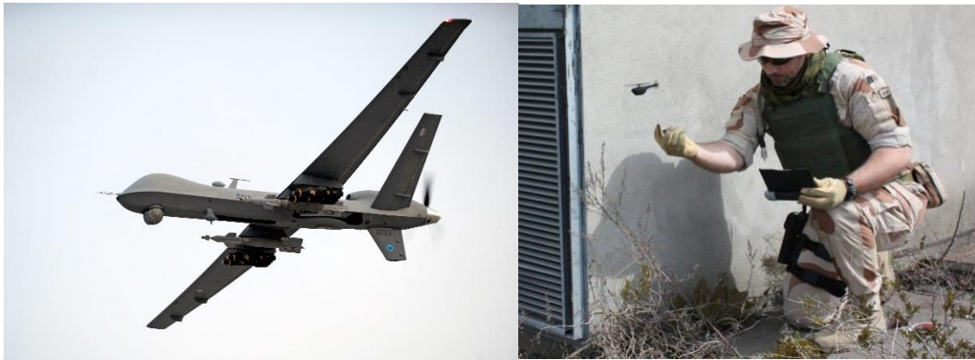
Figure 6-7. A British Reaper operating over Afghanistan in 2009 and a Black Hornet Nano

on the ground with local situational awareness. They are small enough to fit in one hand and weigh just over 16 g, including batteries. An operator can be trained to operate the Black Hornet in as little as 20 minutes. The UAV is equipped with a camera, which gives the operator full-motion video and still images.