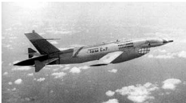
Figure 4. Ryan Model-147 UAV

All together the Ryan Aeronautical made 28 modifications of the Model-147 UAV. The new drones’ tasks included day-and-night photographing, electronic detection, jamming, deception and spreading leaflets. The fast reaction was delayed by the fact, that information gathered with this could be analysed after the UAV’s return. By 1972 it was even possible to broadcast the data live to the ground station. The Ryan Model 147-SC was equipped with TV camera and datalink system. The Ryan Model 147N could amplify its radar signals, so it was detected as it was a much larger target [13]. From 1972 the UAVs joined the propaganda warfare by spreading leaflets, because the conventional airplanes had suffered serious damage during these missions.