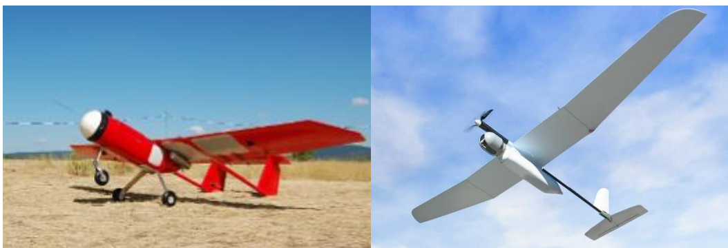
Figure 8-9. the Meteor-3 ready for departure and an airborne Skylark

This article would not be complete without briefly mentioning the Hungarian UAV developments and researches. The Meteor PTA family has been produced for Hungarian Defense Forces since 1999 by the Aero-Target Bt. These UAVs are used mainly to train the air defense units' personnel, on the practice missile shootings. The first product was the Meteor-1 in the series. In 2005 the company won the competition to modernize the existing PTAs. The Meteor-3 [figure 8.] made it possible to provide cheap and fully Hungarian target material for the users. This UAV is able to follow a route automatically. Even though its top speed is only 140 km/h, its duration is 40 minutes and range is 60 km. The Meteor-3 has a payload of 4 kg including fuel, and ceiling of 3000 m. It can carry up to 4 pyrotechnic cartridges, but can be mounted with radio telemetry too. In addition it can transport a 180 mm Luneberg lens to increase its radar cross section. The 2.7 m wingspan, 1.8 m long and 11kg body is powered by a 30 cm 3 piston engine. It is launched with the help of catapult and it lands on its skids. Unfortunately, its slow speed decreases its credibility, so the producer began developing a faster PTA.