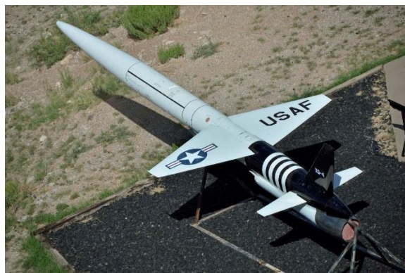
Figure 3. The AQM-35 supersonic target PTA

After the Second World War, researches related to the UAVs continued, which was supported by the big development of automatic systems. In the 1950s with the appearance of aircraft and missiles flying over the speed of sound, the air defense units needed new assets to simulate targets like these. Military leaders wanted to develop pilotless target aircraft with supersonic speed. In 1953 the Radioplane branch of Northrop started working on the AQM-35 supersonic PTA, [Figure 3.] which carried out its first take-off in 1956. It was able to fly as fast as Mach 1.55. Its main task was to help with the training of air defense missile units against supersonic airplanes. Even though it was possible to launch it from the ground, most of the cases it was launched from an airplane, from where it was controlled. All together 25 models was build, but the program was stopped, because the UAV was so fast that the air defense systems couldn't track it, so they were unable to lock on this UAV [13].