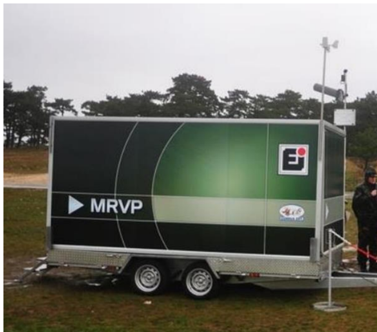
Figure 9. Deployable command centre [20]

Due to the technical evolution of the last decades this issue is topical again, because unmanned aerial systems went through a great evolution and continuous improvement, even turbulent. Several types exist, such as fixed wing, rotor driven and even flapping-wing (ornithopters). One type can fly faster than the speed of sound, one weighs only a few grams and one is capable to depart with several tonnes of take-off mass, one can only fly a few hundred meters from its base of operation and other types are capable to fly across the continents. They can fly autonomously or can be remotely controlled by a human, or it can be a combination of both. Common feature of these constructions is the necessary presence of technical personnel [7].