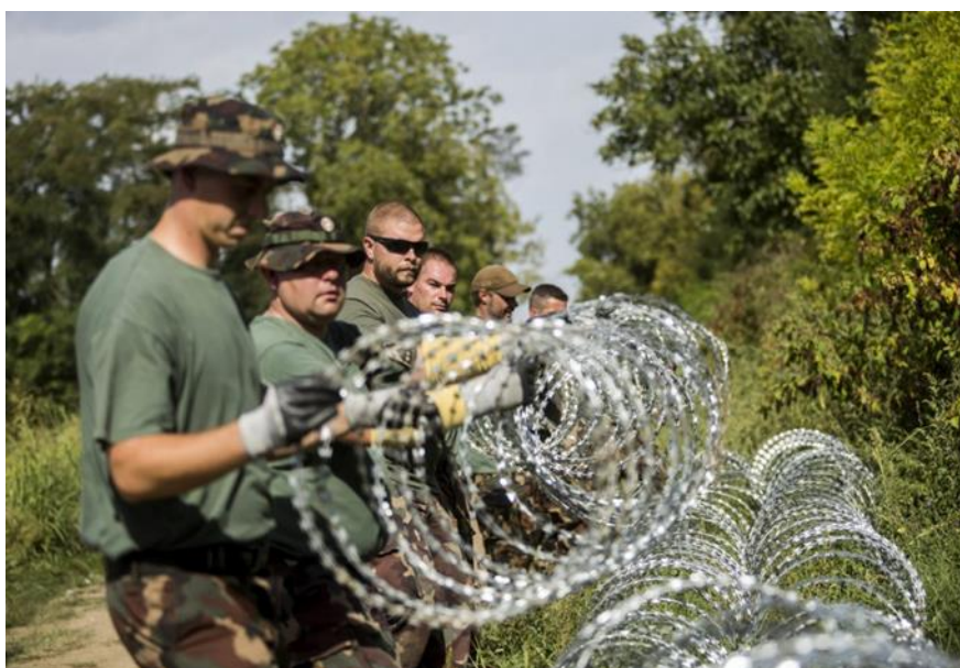
Figure 6. construction of Temporary Border Fence started on the Hungarian border [17]

(NATO standards) barbed wire to achieve the desired result. In addition, under the command of police forces, units of the Hungarian Defence Forces started also to patrol together with the police. The implementation of border defence tasks consisted of 3 main duties. These were technical (vehicle) and infantry patrols, high-stand observation and air patrolling. In parallel with the establishment of this technical border barrier the construction of an additional three meters high wired fence also started to strengthen the defence capabilities of the already deployed first defence line. This defence line was called Temporary Border Fence (TBF). There was also a need to modify the legislative environment in force, because, according to Hungarian law, crossing or destroying the technical border barrier was only an administrative offence. On 4 September 2015, the National Assembly of Hungary adopted law CXL 2015, whereby the destruction or illegal crossing of the technical border barrier constitute a criminal offence which may be sanctioned with immediate expulsion.