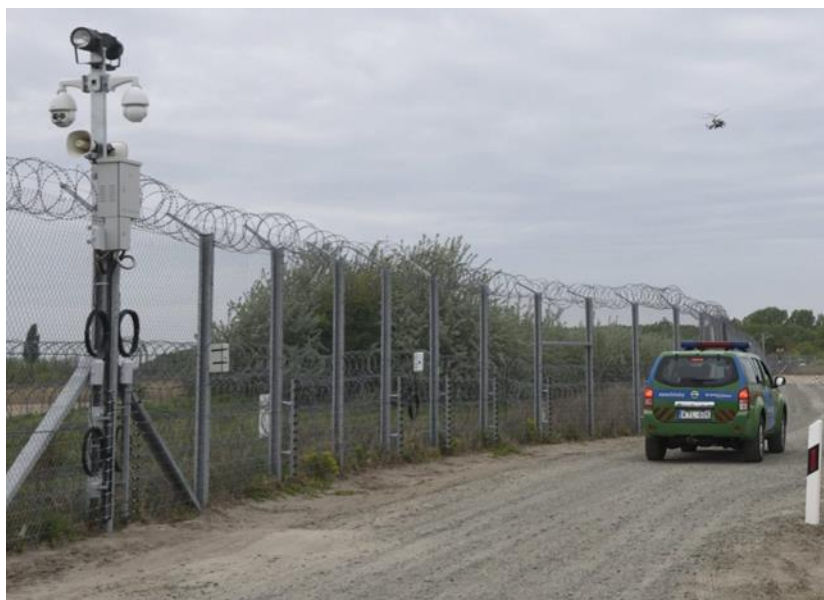
Figure 7. Intelligent Signalling System (ISS) [18]

which operates with and detects restricted voltage impulses. Sabotage of the system triggers an alarm which is detected in the Command Control (CC) centres established for this reason in police headquarters. After the evaluation of these alarm signals actual patrol forces of the Ministry of Interior and the Ministry of Defence 5 were tasked. The second line of fence is equipped with such enhanced technical substance that makes it significantly difficult to cut through it. Manoeuvre and service paths have also been constructed, which improved the rapid and professional intervention in the prevention of illegal border crossings.