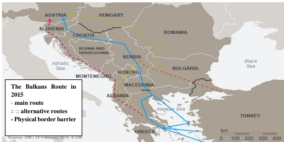
Figure 4. The Balkan route [15]

The next aspect of migration is the determination of wandering routes. The possible existing alternatives of reaching Europe are clearly highlighted in figure 4. Because of its relevant efficiency, the route highlighted with blue is used the most frequently. The main barriers of the shortest route to approach are the existence of natural barriers, malignant and armed guerrilla groups and man-made barriers such as technical barriers (border fence). To accomplish long term preventive function to technical barriers we have to guard them. Guarding of technical barriers will be introduced by the authors in the next chapter.