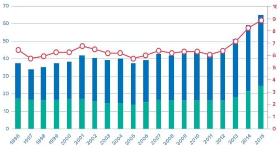
Figure 1. The global number of refugees per 1,000 people in the world [12]

a significant role in the development of the migrant crisis in Europe in 2015 and could have a significant role in its handling too” [1].