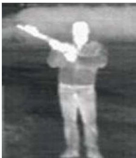
Figure 10. 23 meters: 84 pixels resolution [21]

human body's thermal imaging highlighted on figure 10 and they can send an alarm to the control centre automatically. Identification is possible from 16 pixels / meter. From this distance it can be determined if the person is armed or not. After the alarm the controlling personnel of the UAV can inform the relevant police patrols and can continue the manually controlled reconnaissance and analysis of the affected area. In addition, the UAV can supervise, and record police measures taken against illegal migrants. Use of these aerial vehicles may be great assistance against illegal migrants, who enter Hungary by damaging the temporary border fence and those who are already inside the country.