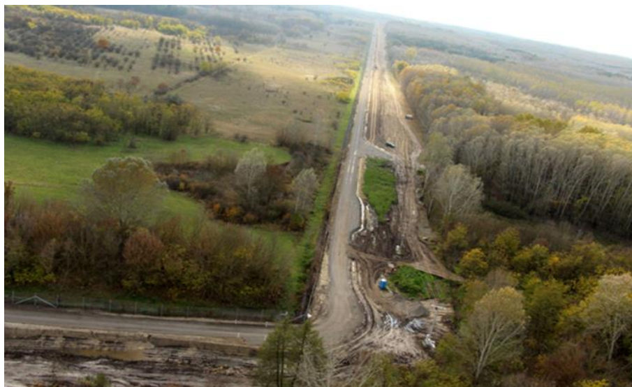
Figure 8. The border from a bird's eye view [19]

published in the Hungarian Official Journal to promote conditions for uninterrupted work during the construction of the fence. Under legislation, unauthorized access to the construction site, hinder of works or to control an unmanned aerial vehicle in its air space is punishable and incur a financial penalty.