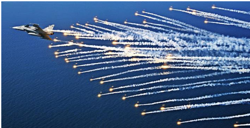
Fig. 6: JAS 39 Gripen with flares [48]

The Hungarian JAS-39 version has an advanced Internal Jammer with forward and rear antennas and 4 passive counter-measures dispensers. The jamming system is able to provide different types of jammings. The dispensers are located on the upper and on the lower side of the aircraft to ensure the dispersion into the upper or lower airspace. The dispensers work based on the program, uploaded into the EWCU by the support team. Based on the possible danger, it is possible to load into the dispensers chaff and flare as well on the ground. The dispensers are manufactured based on the NATO standards and can be filled with different size of ammunition. [46][47]