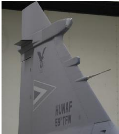
Fig. 5. Rear-antenna for the EW System [45]

The Hungarian JAS-39 version has an advanced Internal Jammer with forward and rear antennas and 4 passive counter-measures dispensers. The jamming system is able to provide different types of jammings. The dispensers are located on the upper and on the lower side of the aircraft to ensure the dispersion into the upper or lower airspace. The dispensers work based on the program, uploaded into the EWCU by the support team. Based on the possible danger, it is possible to load into the dispensers chaff and flare as well on the ground. The dispensers are manufactured based on the NATO standards and can be filled with different size of ammunition. [46][47]