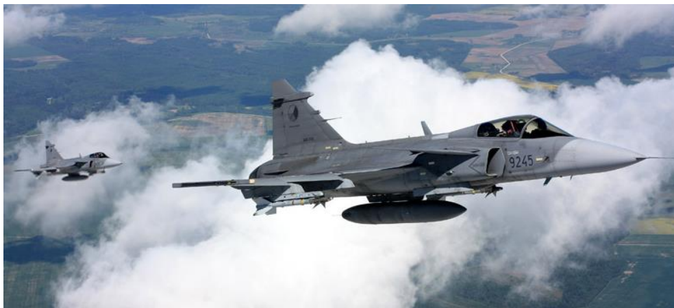
Fig. 2: A two-ship formation of Czech Air Force JAS-39 over the Balticum. [21]

“The air assets deployed on the mission maintain a permanent readiness posture to scramble at short notice and take deterrent of other actions against the trespassers on 24/7 base.” In February 2013 the North Atlantic Council approved the lengthening of the Baltic Air Policing mission instead of the scheduled 2014 finishing. [19] Hungary announced in 2012, during the NATO meeting in Chicago, that between 2015 and 2018 the HUNAF can participate in this mission. [20]