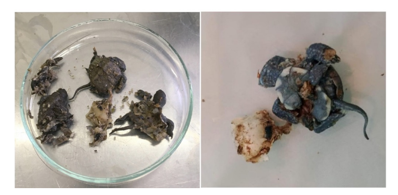
Figure 2: European Pond Turtle ( Emys orbicularis ) embryo found from one of the jackal stomachs