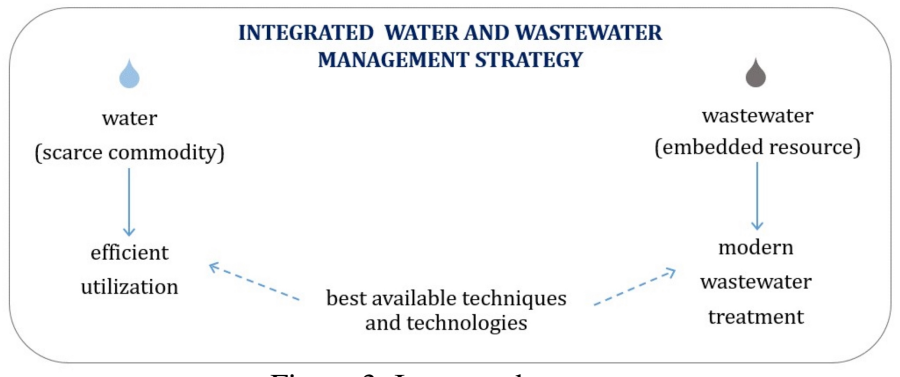
Figure 3: Integrated strategy.