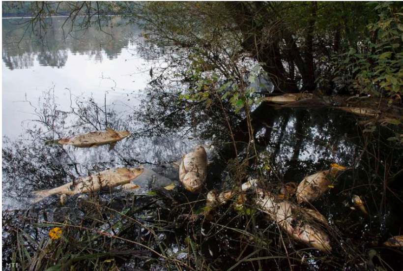
Figure 3. Fishkill in the river[10]

The same importance of water pollution seeing for the fish producers and other private people, whose primary income is the fishing. As a result of the contamination can decrease dramatically the number of the fish population, which maybe makes citizens engaging finish their fishing, which raises social issues (unemployment, supplementary aid, etc.) as well.