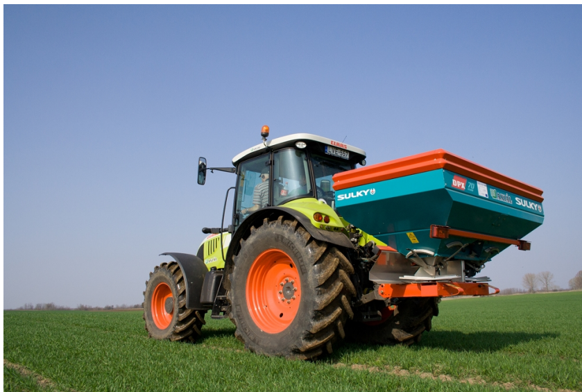
Figure 1. Fertilizer spreader [8]

Domestic researchers [6, 7] were examined for the period 1970-1990, Hungary is characterized by chemical and it was found that our country's use of fertilizer along the Western European level was also accounts for up to half the chemicals we were able to achieve outstanding yields. According to Kádár [7] in our country so close to 1/3 more exposure than the nutrient has been added. Kádár's (2005) statement was confirmed by Németh (2007). Figure 1 shows the fertilizer spreader. In '70 - '90s were not able to meet the needs of the plant and the soil nutrient content of the fertilizer, therefore implies the positive balance of the soil nutrients.