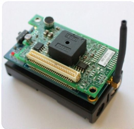
Figure 1 The Crossbow wireless mote

Wireless sensor networks are useful because there is no need for wires and this provides the possibility to measure quantities which were not possible in the past. Measuring in highly explosive risk areas was a problem due to the potential levels of grounds. Highly corrosive vapours in the air damage the cabling of sensor networks requiring frequent maintenance. Wireless sensor networks are successfully used in forest fire detection systems, monitoring of agricultural microclimate, monitoring of traffic structures and their load (Gogolak et al 2010). The Crossbow IRIS (Fig. 1) wireless sensors nodes compliant with IEEE 802.15.4 standard were used for measurement of the RSSI values. Crossbow technology has compact wireless modules with complete software support. The 2.4 GHz modules have an 8bit low power microcontroller on-board and a wireless stage. The Atmel 1281 microprocessor is easy to program and has wide software support.