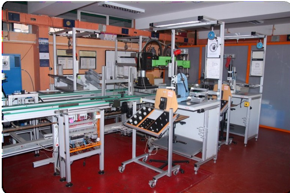
Figure 3 The industrial laboratory

In the second phase of our experiment the process of localization was done in industrial environment, in an industrial laboratory equipped with an assembly line for assembling water pumps. This industrial laboratory provides the conditions of an industrial environment for studying wireless communication and localization processes (Toman et al 2009, Sárosi 2012). Fig. 3 shows the industrial laboratory.