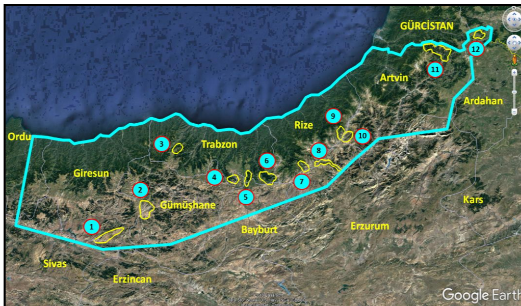
Figure 2. Sampling sites in the Eastern Black Sea Mountains