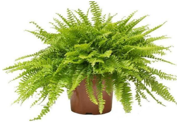
Figure 1. Nephrolepis exaltata Schott (Boston fern)

were chopped to (1.0 cm) long segments (explants) before being put individually in - MS medium free hormones for three weeks. Each treatment included nine explants for three replicates. At the end of the sterilization period percentages of contamination-free, and surviving explants were calculated. Contamination-free and surviving explants were taken for multiplication stage.