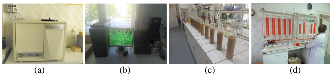
Figure 1. Equipment of soil analysis. (a) CHNS elemental analyser for soil total N and S determination. (b) Flame photometer for determination of available potassium in soil. (c) Soil particle size determination by pipet method. (d) Determination of carbonate content in soil by Scheibler's calcimeter, volumetric method

All laboratory analyses were performed at the Laboratory for Soil and Agroecology of the Institute of Field and Vegetable Crops, Novi Sad, Serbia, accredited according to the standard ISO/IEC 17025: 2017 (Fig. 1). The pH value in 1:2.5 (v/v) suspension of soil in 1 M KCl and H 2 O was determined using a glass electrode, in accordance with the ISO method 10390:2005. The hydrolytic acidity values were determined according to Kappen (1929) in calcium acetate solution by titration method. The carbonate content as free CaCO 3 was determined by the volumetric method ISO 10693:1995. The organic matter content (OM) was measured by the sulfochromic oxidation method ISO 14235:1998. The total N and S were determined by elemental analysis on the CHNS analyser VARIO El III according to AOAC 972.43 (2000) method. Readily available phosphorus (P 2 O 5 ) and available potassium (K 2 O) were extracted by ammonium lactate extraction (AL method), and measured by the means of spectrophotometry and flame photometry respectively (Egner and Riehm, 1955). Particle size distribution in the <2 mm soil fraction was determined by the pipette method (Van Reeuwijk, 2002) and soil texture determined according to International Union of Soil Sciences (IUSS) system of classification of soil particles.