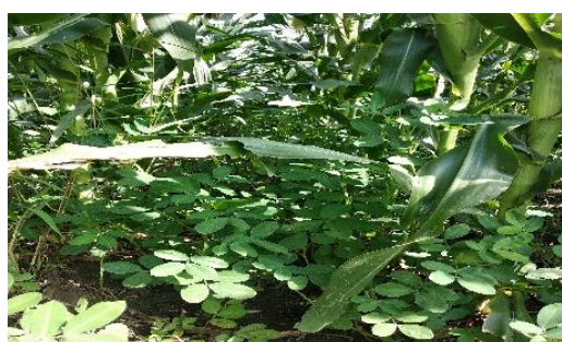
Figure 5. Control plot (no mulch)