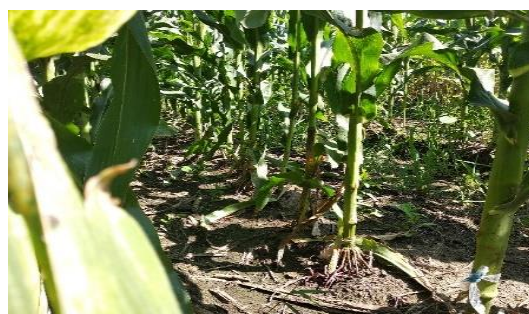
Figure 6. Groundnut-maize intercrop

Figures of the various treatments are presented above (images were taken at 12 weeks after planting during 2018 season at Jilin Agricultural University, China)