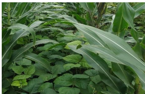
Figure 3. Green gram-maize intercrop