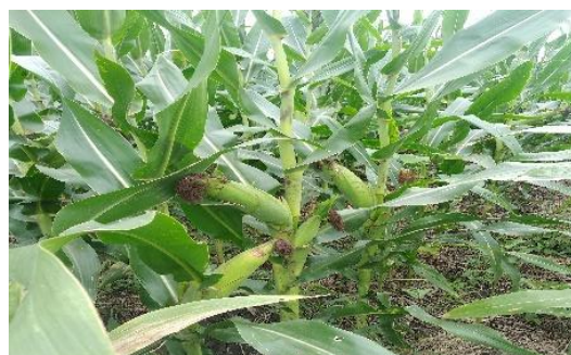
Figure 4. Maizestraw-maize