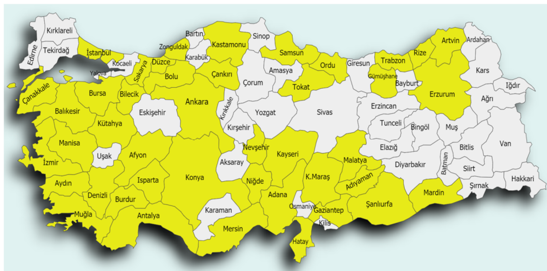
Figure 1. Provinces included in panel data analysis

increase productivity. For this reason, it is considered that the most important factor in order to increase the production in organic agriculture is to increase the agricultural areas. In the research, the variables of the amount of organic agricultural production of the provinces and the production area and number of farmers were used for the analysis of the factors affecting the amount of organic agricultural production.