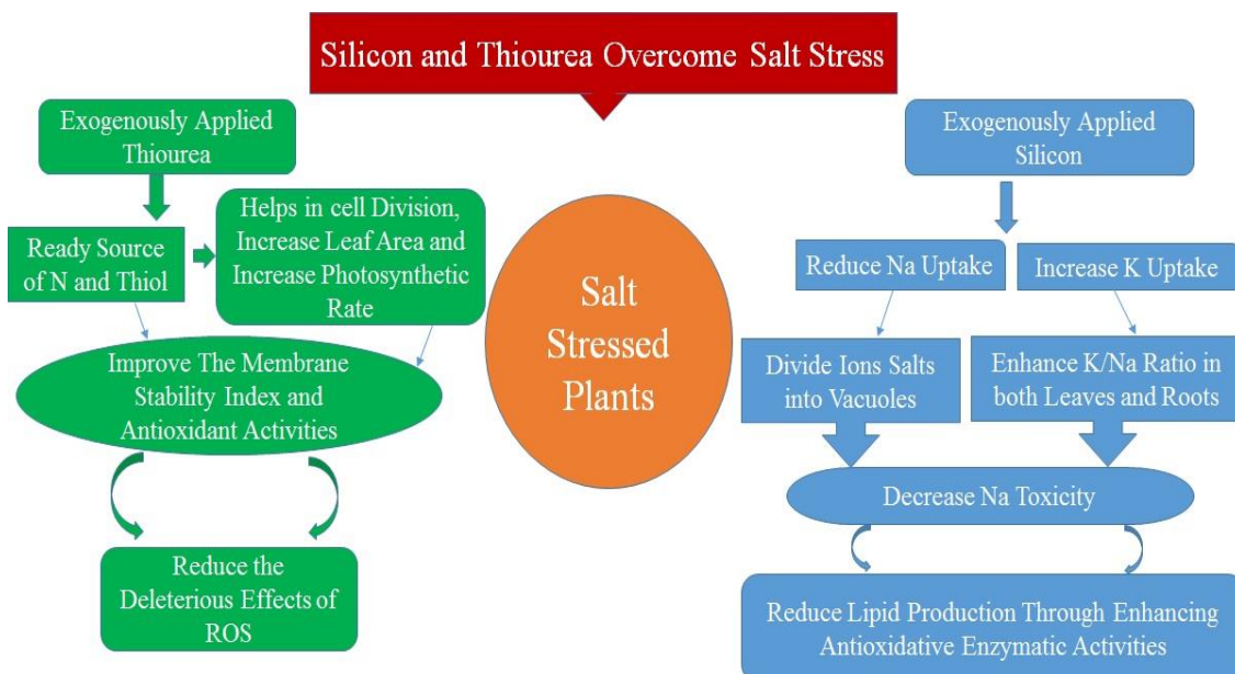
Figure 3. Mechanism of silicon and thiourea mediated salinity tolerance in fodder beet