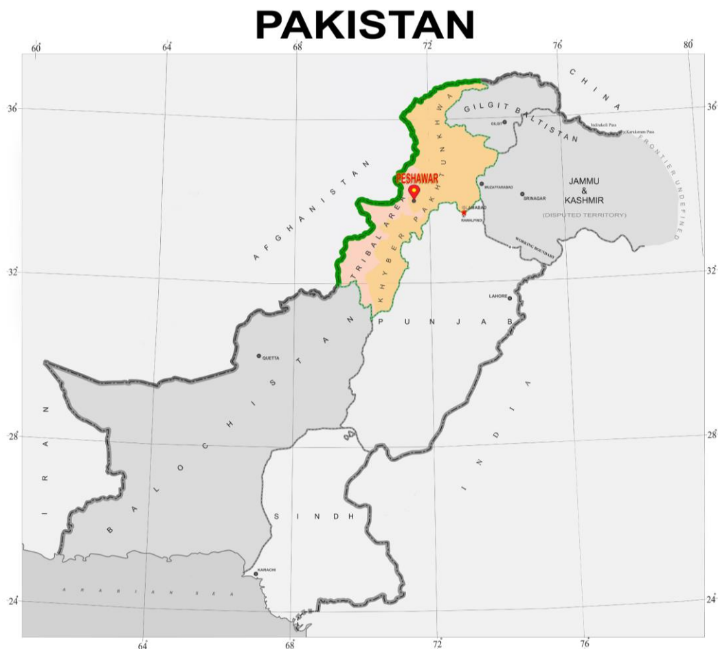
Figure 1. Location of the study site in the Peshawar city of Pakistan.

Metolachlor 400 g/L, Atrazine 320 g/L) at rate of 2000 ml ha -1 two weeks after sowing maize crop. On the basis of calibration for experimental area, 250 l ha -1 water was used for the herbicide application. Furadan (Carbofuran) was applied at rate of 10 kg ha -1 with second irrigation and 10 kg ha -1 with the third irrigation. During the whole growing season, uniform agronomic techniques were performed in all sub plots.