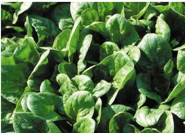
Figure 1. Sprinter F 1 is spinach cultivar that used in the experiment

As plant material, the Sprinter F 1 spinach cultivar with high market quality, flat leaf surface, wide oval shape, bright green color, bump foliar, medium stem with high yield potential, and fast growth was used in the experiment ( Fig. 1 ).