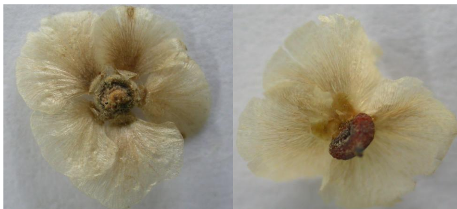
Figure 2. The pictures of two desert plant seeds morphology ( H. ammodendron seed on the left and A. aphylla on the right)

The seeds of both species are similar in shape and have perianth segments. The seed of H. ammodendron is larger than A. aphylla , and both seed is gray or black ( Fig. 2 ). Its average diameter is 2.13 mm and 1.88 mm, while thousand seed weight is 1.90 g and 1.45 g, respectively. It was found through preliminary experiments that seeds of both species could germinate at 2 °C ( Fig. 3 ).