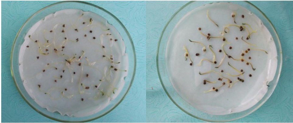
Figure 3. The pictures of two desert plant seeds germinated at 2 °C ( H. ammodendron seed on the left and A. aphylla on the right)