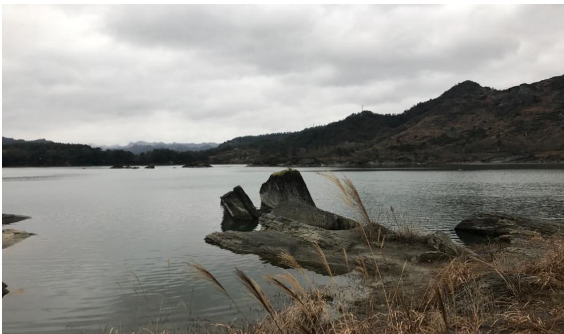
Figure 1. The experimental site of Qianjiang Xiaonanhai National Geopark

science popularization for public and scientific research for experts and scholars. It can provide sightseeing, leisure and other tourist activities with scientific education. Figure 1 shows the research site.