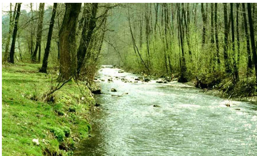
Figure 2. Natural reference reach of the Oščadnica stream