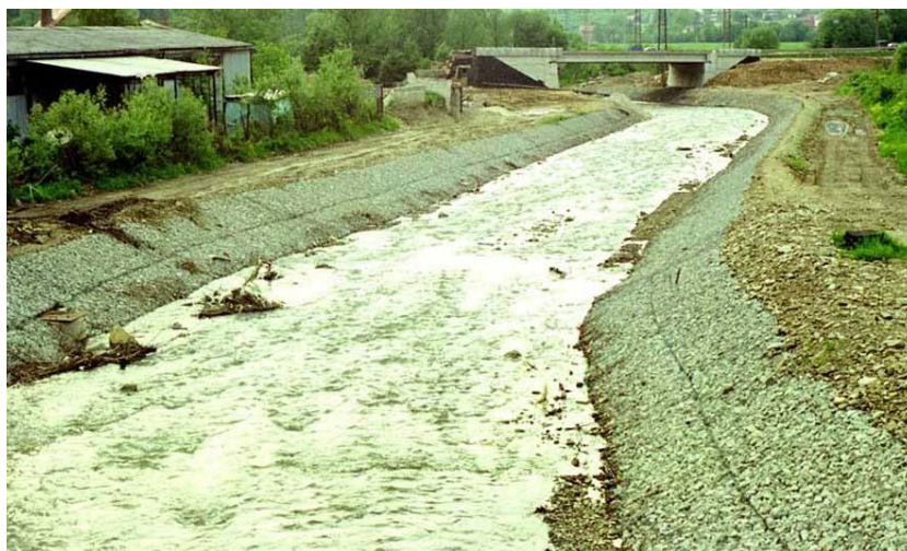
Figure 3. Regulated reference reach of the Oščadnica stream; the riverbanks are stabilized by wire mattresses

In the regulated reference reach, the stream channel has a simple trapezoidal profile with slopes on a gradient of 1:1.5. The slopes and the base are stabilised by wire mattresses. The reference reach lacks riverbank vegetation ( Fig. 3 ).