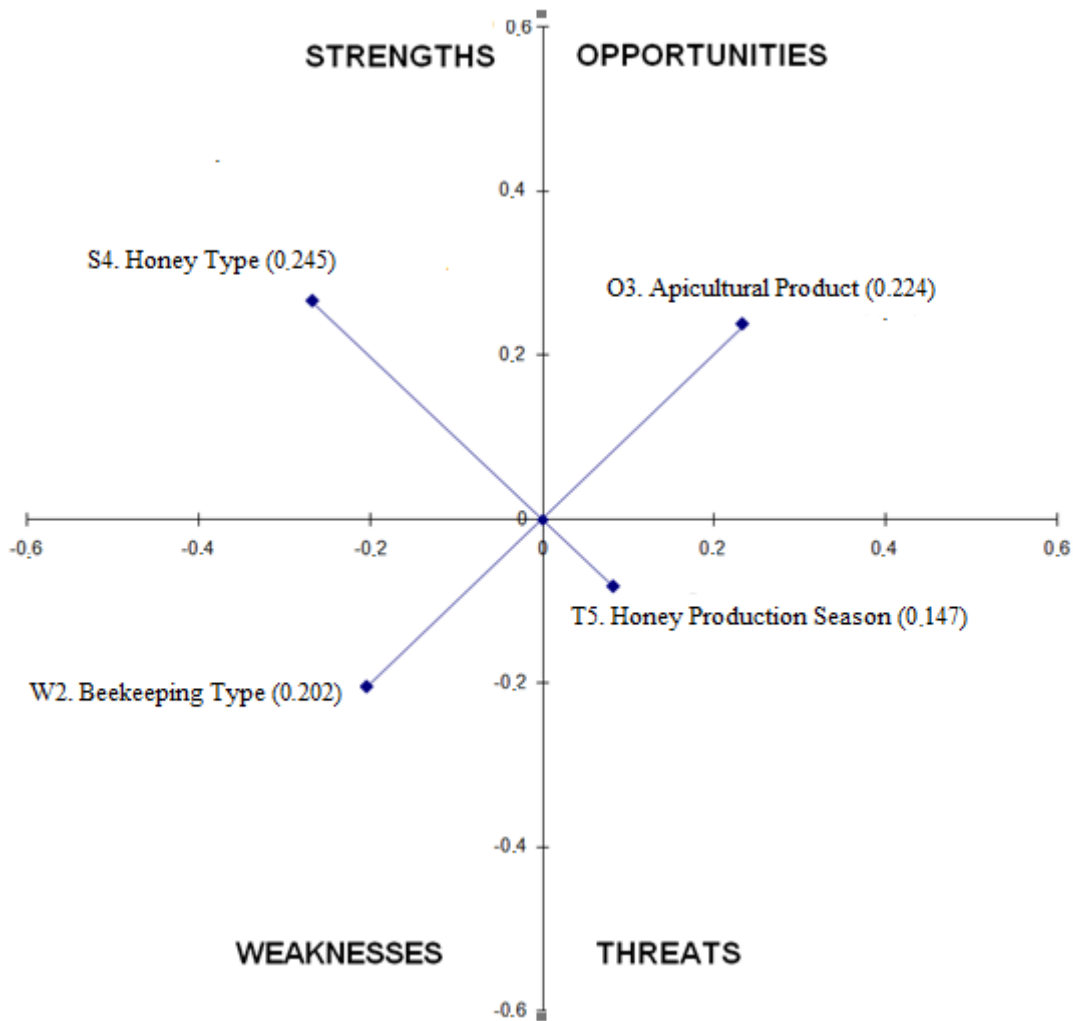
Figure 4. An illustration of the relative significance of SWOT factors in an A'WOT application to HPF optimum management strategy

When Table 5 is examined, Strengths group has the highest score in the SWOT group with 0.352. This is followed by Opportunities with 0.324. Weaknesses with 0.172 ranks third and Threats with 0.151 is the last. According to these results, it is understood that in the development of the HPF management strategies for Bartın Province, a structure, which emphasizes Strengths and Opportunities and dismisses Weaknesses and Threats, should be adopted. Moreover, "S4" in the Strengths group has the highest score among the SWOT factors with 0.245 (0.086 in the total average). "O3" with 0.224 (0.073 in the total average) from Opportunities group ranks second. "W2" with 0.202 (0.035 in the total average) from the Weaknesses group ranks third and "T5" with 0.147 (0.022 in the total average) from the Threats group is the last one. In addition, showing the values obtained on the figure is given in Figure 4 .