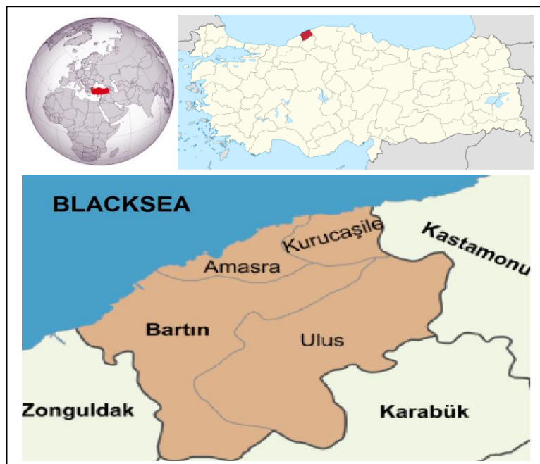
Figure 2. Geographical location of Bartın Province

Bartın Province, which has a high portion of forest assets, is also well above the country average in terms of forest villager density. Therefore, Bartın Province, which has an important potential for honey production, is well below the country and the region average in terms of honey yield level (Table 1). As can be understood from these statistics, Bartın Province could not tip the scales in its own favour in honey production.