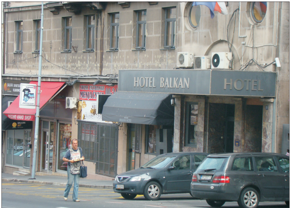
Photo 1. Hotel Balkan in Belgrade: where tourists can be positively disappointed too

These examples prove that inherent negative associations can be converted into positive ones by transforming the geographical names into brand names used in tourism. This is largely facilitated by the fact that tourism is one of the economic sectors associated with the highest number and most favourable pieces of news (WTO 2002).