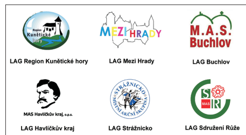
Fig. 2. Selected examples of LAGs' logos with historical elements

A total of 23 LAGs have a logo that evokes history. Of these, only 10 LAGs have names based on history. In the logos, the stylized motif of the monument is used most often (12 times) (e.g. a castle, a manor, a monument, a pilgrimage church), or its silhouette, or its setting into a broader panorama of its landscape. In most cases, it is a specific building that is characteristic for the region in question (e.g. LAG Kunětické hory; see Figure 2).