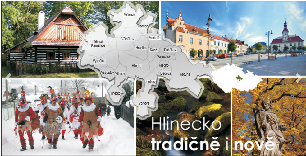
Photo 1. The example of introductory photographs depicting both folklore tradition and historical monument, LAG Hlinecko.

historical or historicizing topics the most. We subjected the selected LAGs to intensive research on how they use history and its re-interpretation in official documents and LAG presentations. We managed to identify several general approaches that can be divided into four topics: monuments, tradition, identity, and historicizing events.