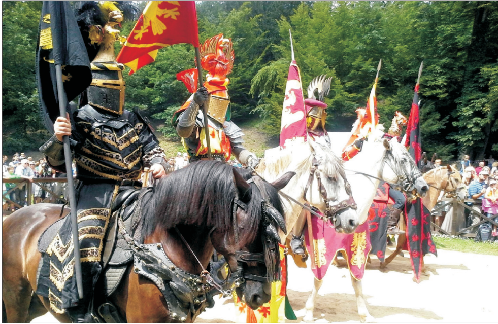
Photo 2. Historic costume is very common way of the commodification of history.

Here, we would like to turn the attention from the commonly used strategies to several specific cases, where the reinterpretation of history is an important component of the LAG's communication strategy. In its presentation, LAG Hlučínsko refers to its peculiar history, which it defines as a "specific historical, cultural, and national development that has no equal in our state". The region's identity is significantly influenced by its position at the border, which changed state affiliation six times since the middle of the 18 th century. This history had an impact on its ethnic and linguistic makeup, which, despite the dramatic changes in the 19 th century, can still be seen today, including in its folk name "Prajzsko". LAG Hlučínsko used its specific dialect and the region's other characteristics (level of religiosity, inhabitants' feeling of togetherness) in its inward and outward presentation and used them to define itself against other regions. Its specific dialect and historical sign has even made it into the