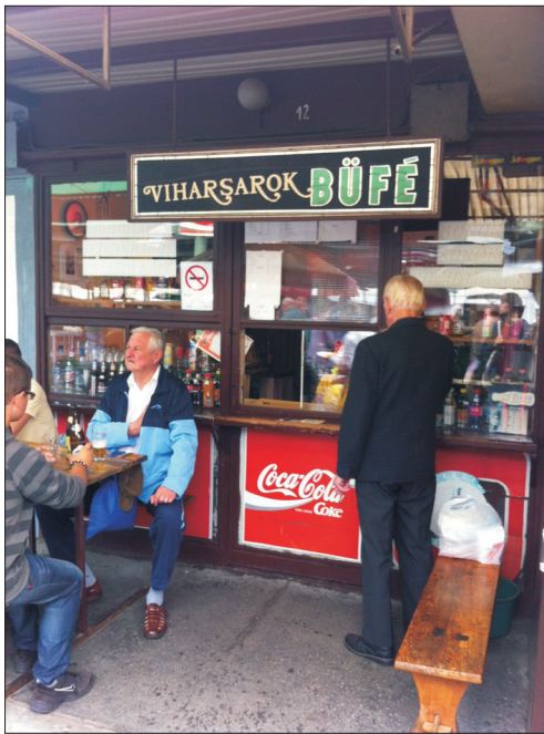
Photo 2. In the 2000s, the Land of Storms has typically been associated with an aging population and a lack of dynamism, but also with considerable potentials for food production and culinary tourism

The contrast between the ways centrality and peripherality are portrayed is particularly apparent in two successive issues of Világjáró , a quality travel magazine. The