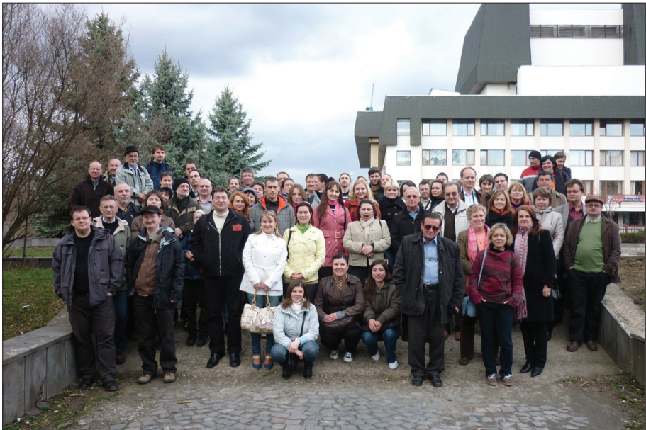
Participants of the professional excursion to Uzhhorod