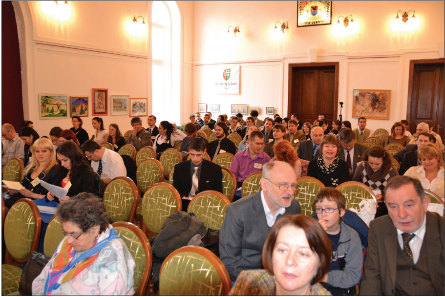
Participants of the plenary session