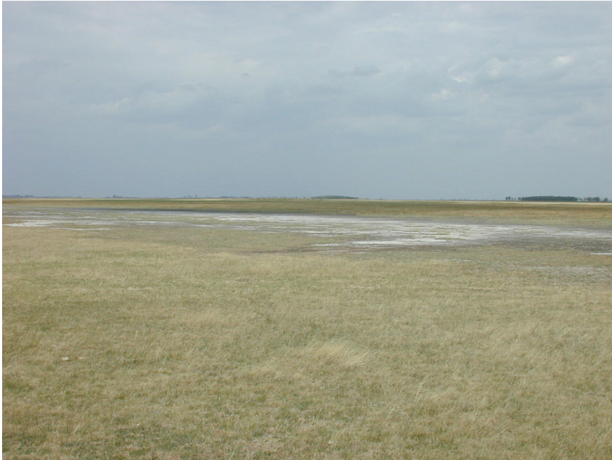
Photo 2. Saline spot on the Danube-Tisza Interfluve, near Apajpuszta

(3) Soil contamination can originate from both diffuse and local sources. Contamination from the atmosphere, from running water or from the soil belong to the first group. These processes may cause acidification, eutrophication and other severe damage. The direct application of chemicals (fertilizers, pesticides and sewage sludge), sometimes also containing heavy metals, are also diffuse sources. Local contamination sources can be of diverse origins and are usually connected with industrial activity.