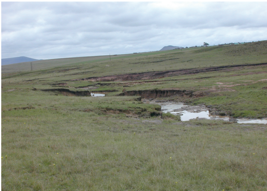
Photo 1. Gully erosion near Bergville, South Africa