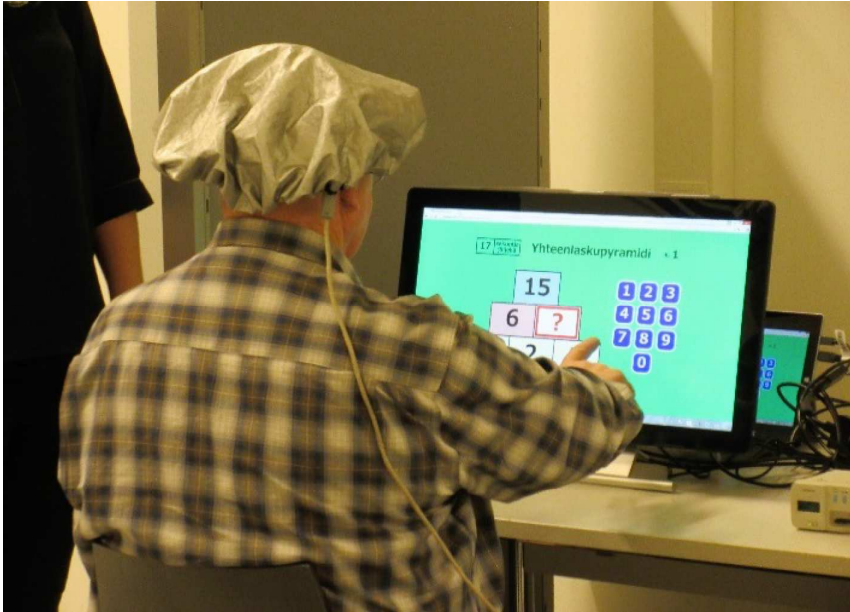
Figure 3 NIRS device being used for an elderly person from the Finnish test group.

test setup the usability and acceptability of the Brain Trainer Exercise Game was evaluated with questionnaires and interviews developed by Sendai Television Broadcasting Company. These questionnaires were translated into Finnish for the Finnish test groups. All the different test setups also involved direct observation of the test subjects. The tests were conducted according to the same exactly protocol in Finland and Japan [15].