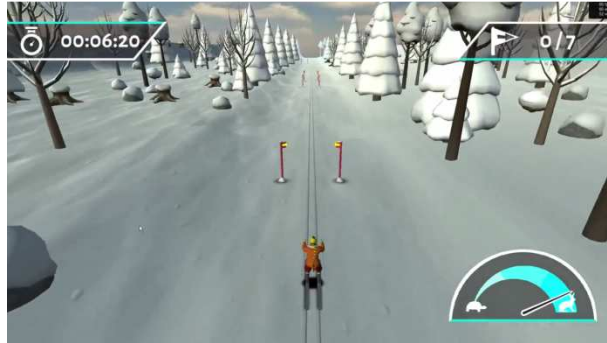
Figure 1 Screenshot from the Skiing Game

Based on the findings from the usability testing in Japan, we observed that the experiences and feedback of the elderly during and after the gameplay were noticeably positive. They were interested in playing the game and they would like to play it again. Therefore we claim that the Skiing game is an easy and user-friendly game for the Japanese elderly. Furthermore, most of the elderly agreed that playing digital games is an easy and effective way of exercising [14].