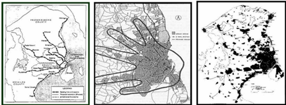
Figure 3.: The realization of the “Finger Plan” in case of Copenhagen [6]

The mature form of TOD is present in Europe, its cradle. Development plans of Copenhagen (“Finger Plan”) or Stockholm (“Planetary Cluster Plan”) are early representatives.