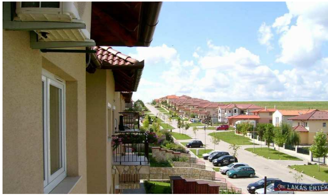
Figure 2.: Typical subdivision

It is may be demagogic to say that move dwellings closer to industrial areas as no one would like to live in the vicinity of one. However, it is highly important to take into account this – in the time of the planning process – latent travel demand.