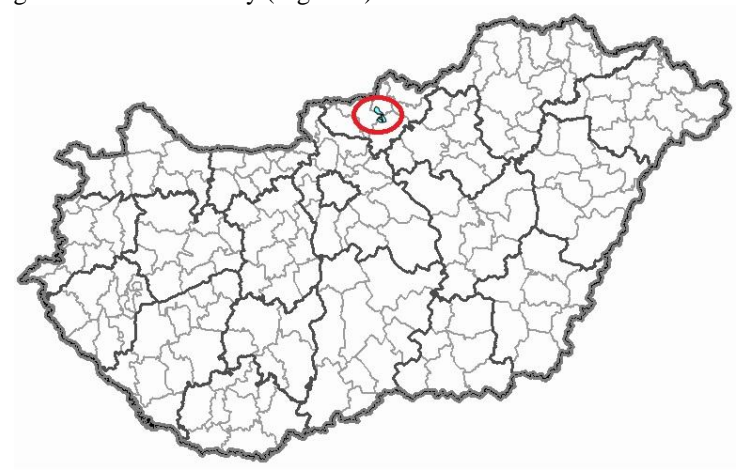
Figure 1: Location of the analyzed settlements

The settlements in question are located in the center of Nógrád county, which is a disadvantaged area of the country (Figure 1).