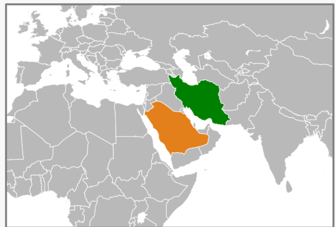
Location of Iran and Saudi Arabia.

The unfolding of the crisis in Syria meant bad news for the leaders of Iran, since it quickly turned into a sectarian conflict with Saudi Arabia, each parties representing and supporting the opposite ends of the conflict. It is also common in Iranian public commentary to emphasize a connection between the self-proclaimed Islamic State with the Wahhabi ideology of Saudi Arabia.