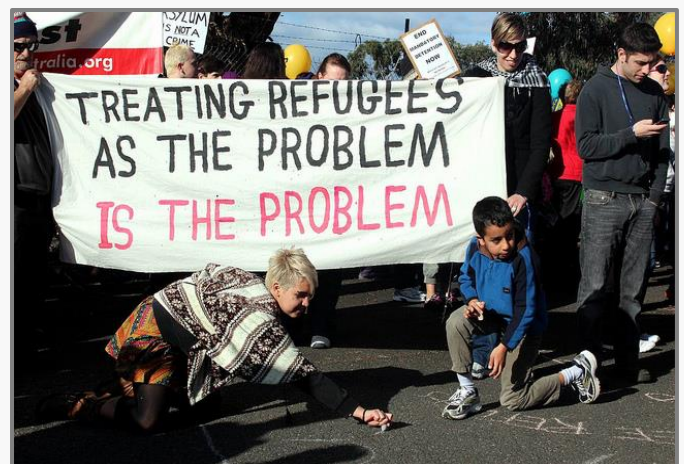
Refugee Rights Protest.

repatriate illegal Moroccan immigrants. This agreement with the king of Morocco, signed on the 28th of January, came to being following the mass sexual assaults in Cologne on New Year's Eve and heightened pressure from Angela Merkel's Bavarian allies to restrict migration flows. Also, Berlin is attempting to reduce the flow of Northern African migration by declaring Morocco, Tunisia and Algeria as “safe countries” and therefore increasing the number of migrants unqualified for political asylum. The wave of millions of people entering the EU alongside failed common policies in regards to regulation of migration flows and relocation of refugees have led many member states to pursue diverse measures in order to secure national borders. The warnings are vast, coming from politicians and academics, but could be summarised by the European think tank Bruegel: “Without a European solution, political pressure will rise and Schengen will be in danger”.