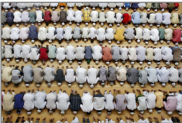
Muslims offer the first Friday prayers.

■ Amid the rising tensions in the South China Sea over competing claims which countries such as Taiwan, China Vietnam, the Philippines, Malaysia and Brunei have, Taiwan President Ma Ying-jeou paid a visit to Itu Aba island to reaffirm Taipei's sovereignty over the outpost. The visit received criticism from Taiwan's ally, Washington, the Philippine Foreign Ministry said all parties had a shared responsibility to refrain from actions that could increase tensions and high officials of Vietnam in Taiwan declared that Hanoi "resolutely opposes" this visit. The lifting work of Taiwan on Itu Aba (the $100 million port upgrade, building a new lighthouse) seemed to be unfazed by China, the two countries claims are based on maps from the late 1940s belonging to the Nationalists, when they ruled all of China and then fled to Taiwan in 1949 after losing the Chinese civil war to Mao Zedong's Communists. The 46-hectare (114-acre) island, which lies in the Spratlys, supports around 180 people, about 150 of them coastguard personnel and has a hospital, an airstrip, and fresh water.