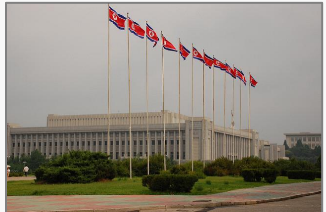
North Korea — Pyongyang.