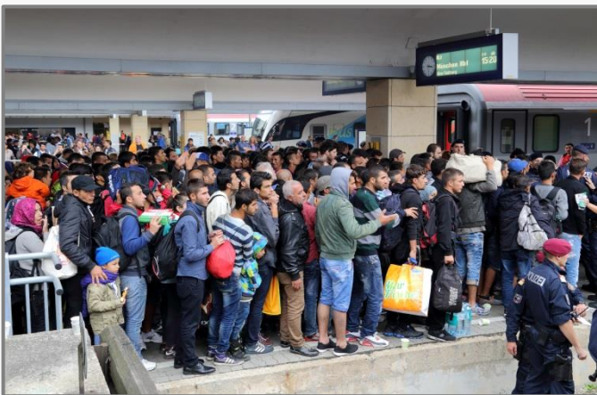
Refugees at Vienna West Railway Station.

All throughout Central Europe debates over national security are underway and many states are pushing for stronger border control. Recently, the Czech and Slovak prime-ministers have announced the need for “back-up EU border plans”. This effort to protect national territory appears as a classic response to a crisis scenario, in which security becomes the priority and freedom may be overlooked.