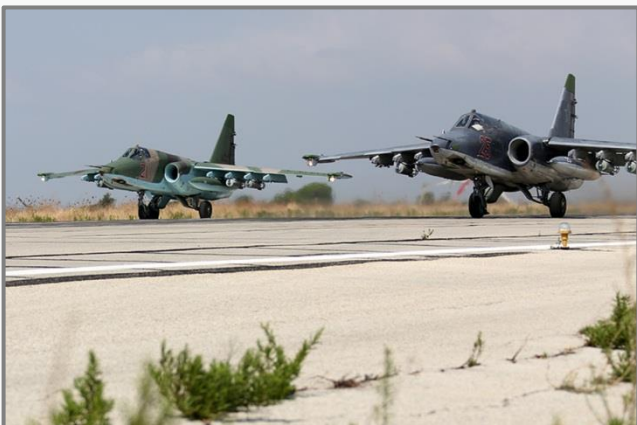
Russian Sukhoi Su-25.

■ As the Islamic State is expanding and stepping up its attacks throughout Libya, Western powers are preparing to keep the terrorist group out of the country. According to Italian Defence Minister Roberta Pinotti the Islamic State is gaining advantage by being able to strengthen in the current political vacuum, which causes Italy and its allies to prepare for an emergency. Ms. Pinotti also added that Italy has been working with the United States, the United Kingdom and France in the past couple of months. The United States has already taken action by sending “a small number of military personnel” to inform and warn the local forces about what is really happening and what results it can cause. Since Libya used to be under Italian possession and is located about 320 kilometres from the Italian island of Lampedusa, Italy wishes to act in a leadership role in the stabilization of the country.