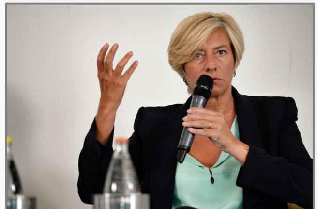
Defense Minister Roberta Pinotti.