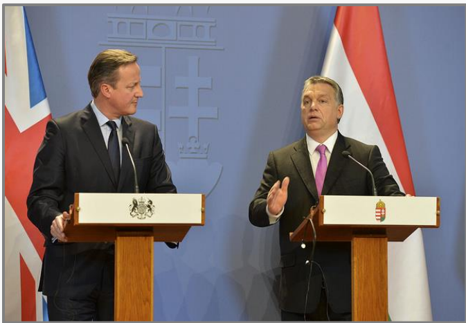
PM and PM Orbán joint press conference.

Earlier this month , David Cameron was told by Viktor Orbán at a conference in Budapest not to treat Hungarian's living in the UK as "migrants". Orbán went on to reiterate the fact that Hungarian people are not "parasites" and in fact give more in taxation to the UK economy than they receive in benefits. This confrontation follows Cameron's efforts to renegotiate an EU deal which would significantly limit in-work benefits for EU immigrants. Cameron has called for the ceasing of in-work benefits to immigrants who have been in the UK for less than four years. The proposal would not affect those already living in the UK however it has been subject to a great deal of criticism from many sceptics. It has