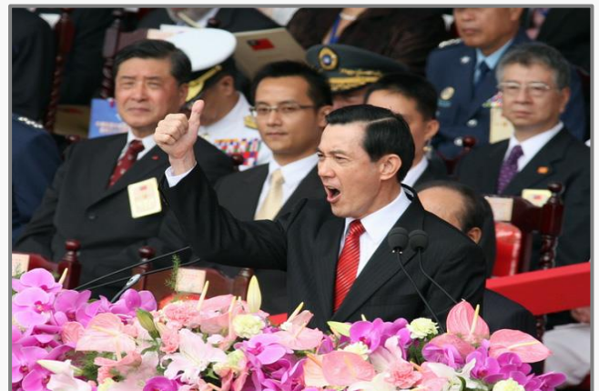
Taiwan President Ma Ying-jeou.