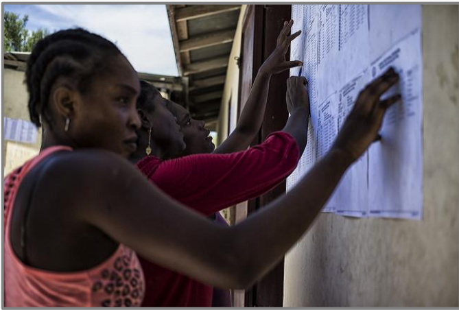
Elections Haiti.

Haiti has postponed their presidential election due to the escalation of violence sparked by the opposition candidate's refusal to take part in a process he claimed was riddled with fraud. Jude Celestine, the opposition candidate, argued that the first ruling in October 2015 was rigged in favour of the President's hand-picked successor, businessman Jovenel Moïse.