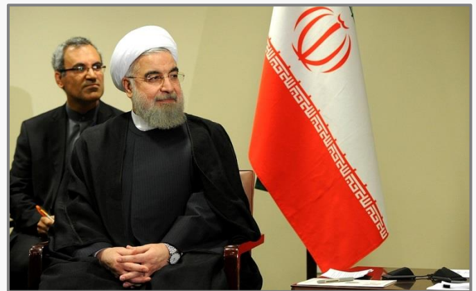
President of Iran Hassan Rouhani.

of stability in the region. He achieved some of his aims and there has been some success with the signing of the nuclear deal with the P5+1 and the approaches' first real benefit was an invitation to New York in 2015, to join a series of peace talks over the crisis in Syria. But internal critics accused Iran's president of compromising too much and being weak against "international regional bullies", like the United States and Saudi Arabia.