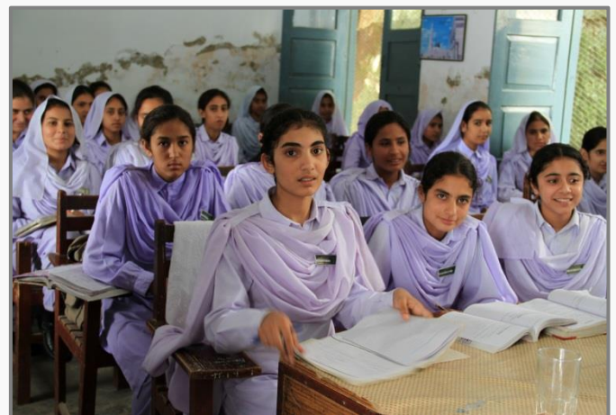
Girls in school in Khyber Pakhtunkhwa, Pakistan.