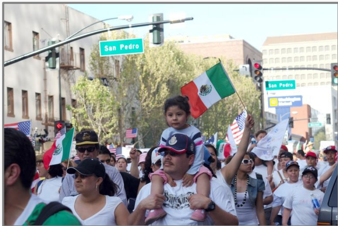
San Jose, California May Day March.

Organisations have recently claimed that about 500,000 undocumented Central American migrants cross Mexico every year in their attempt to cross the border which separates it from the United States. International attention was drawn to a previously lesser-known route used by Cubans to travel from Ecuador in to the US in November 2015, when nearly 8,000 Cubans were seeking to cross the border. Eventually, they found themselves stuck at the Costa Rica-Nicaragua borderline, because the Nicaraguan government refused to let them in the country.