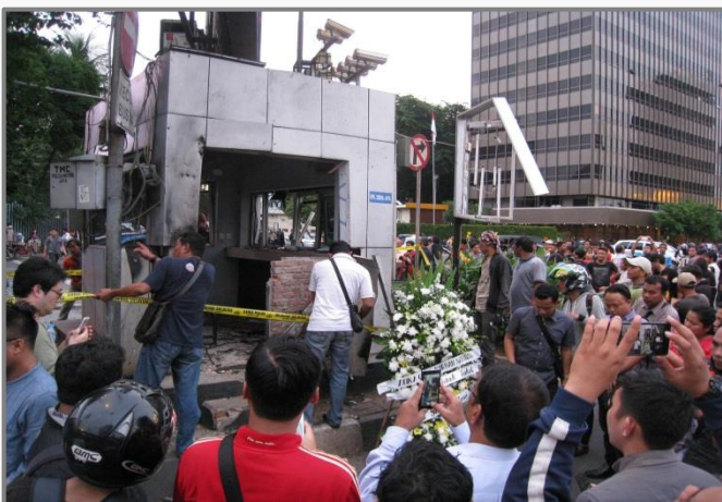
Damaged Police Box caused by suicide bomb attack in front of Sarinah Building.

■ The Indonesian capital, Jakarta, was attacked by terrorist on the 14th of January. The attacks consisted of a series of bomb and gun attacks which wounded seventeen people and killed seven people, five of which are the terrorists and two civilians, one Canadian citizen and one Indonesian citizen. The attacks were reported as imitating the Paris attacks and it was followed by Islamic State claiming the responsibility of mobilising the attacks in Jakarta. Previously in December 2015, Indonesian authorities had arrested nine people suspected Islamic State terrorists with documents outlining a plan to do terror attacks in Jakarta.