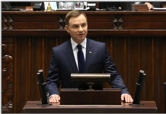
President Andrzej Duda.

The government representatives have stated that this action is a response to the media's bias and aims to promote objective coverage.