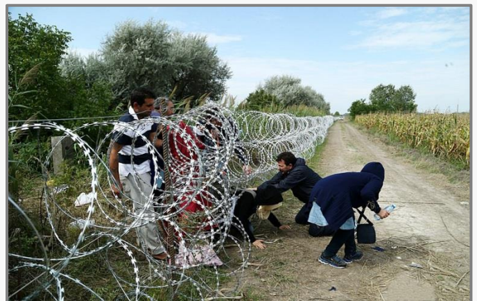
Migrants in Hungary near the Serbian border.

Recently Reuters has announced that “Sweden is likely to deport up to half of last year’s asylum seekers” and intends to tighten its immigration policy by making it harder for companies to employ those who do not possess the proper legal documents. In addition, Sweden has begun to impose checks on its border with Denmark. In fact, several member states, such as Germany, France, Austria, Hungary, have enforced border controls, and in certain cases even erected fences, to tackle the increasing influx of refugees.