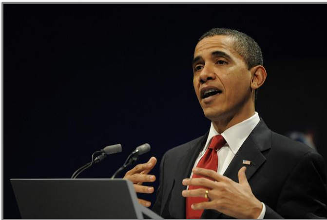
Barack Obama President of the United States.

Fourteen months ago , President of the United States of America Barack Obama issued an order expanding temporary legal status for some adults who entered the US illegally. This is a result of his frustration over Congress' inability to act on immigration reform. The new order granted temporary legal status and work permits to illegal adult immigrants who had been in the US for five years with children who have American citizenship or a lawful permanent residency. President Obama aimed to prevent people from being afraid and instead allow such people to be granted equality as legal American citizens. The action of issuing such a law was a follow-up from a previous temporary reprieve from deportation that he issued in 2012 for children age 15 and under brought to the US illegally. The action