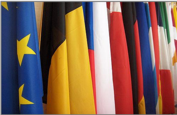
European Union colours.

In December 2015, European Union (EU) member countries had an end of year summit to discuss five current major issues: migration crisis, terrorism, United Kingdom (UK)'s membership in the EU, single market, and EU's Economic and Monetary Union (EMU). However the summit focused more on the issue of the migration crisis and UK's membership in the EU.