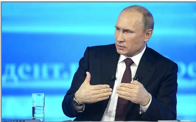
Direct Line with Vladimir Putin.

Russian President Vladimir Putin held his annual end-of-the-year conference on 17 December at the Moscow business center in front of 1,400 journalists. The conference took about 3 hours and 10 minutes and was covered by the state-owned television station, Channel 1.