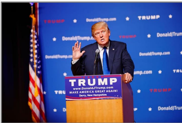
Trump at an early campaign event.

■ In Belgium five people were detained in connection with the Paris attacks. Two people were found after a house search in the Laeken district of Brussels. The first day of the raids resulted in the finding of an additional 3 suspects in another house. The police did not give out details of the arrests. The only information they shared was that these people were to be questioned and that Salah Abdeslam, who was involved in the Paris attacks, was not one of them. The police are still on lookout for Salah Abdeslam who is currently one of Europe's most wanted criminals.