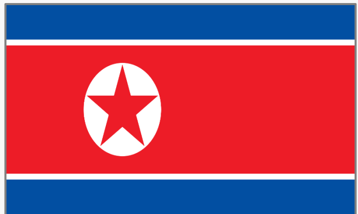
Flag of North Korea.