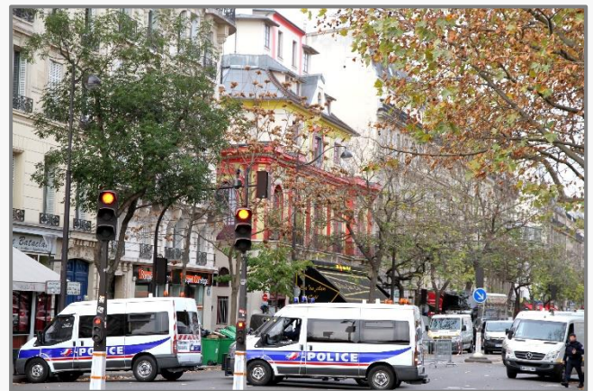
Police gathering evidence.