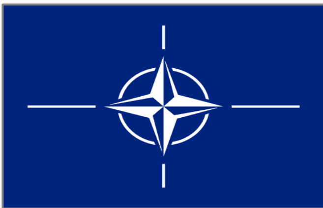
Flag of NATO.

The benefits of joining include the possibility to increase tourism revenues and also potentially more investment could be placed in Montenegro if it were to become a member in the future. Stabilizing the area is the aim of the West and this step would mean a lot for progress. In the future this act could open up new ways to expand the NATO.