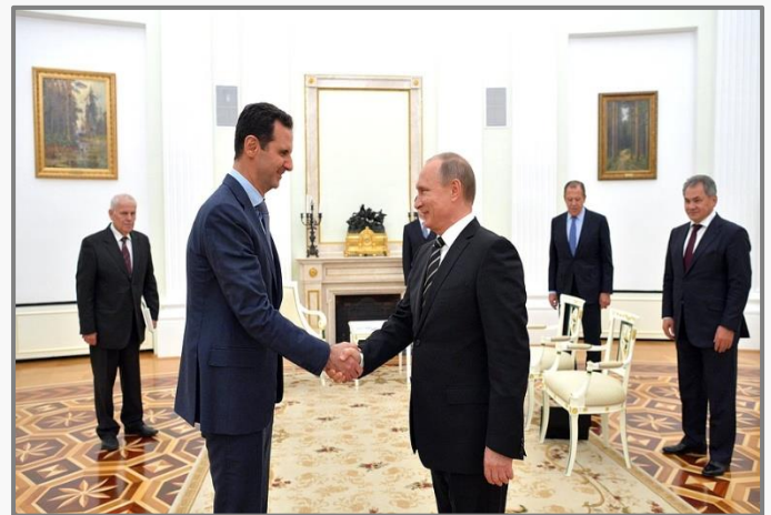
Meeting with President of Syria Bashar Assad.

Assad expresses that since the participation of Russia not only IS forces are shrinking, but also other terrorist groups' power, such as al-Nusra, has been declining. According to Assad are "the facts are telling." However, in September before Russia's involvement, the territory of IS already was in decline.