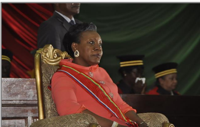
Catherine Samba-Panza, President of the CAR.

the presidency to two terms, battle institutional corruption, create a Senate as the main body of legislature and prohibit “all kinds of religious fundamentalism and intolerance”. The new constitution states that current members of the legislative branch are not allowed to participate in the upcoming elections and members of parliament and the constitutional court would no longer be able to enjoy immunity if found guilty of treason. The vote was a trial run before the presidential and parliamentary elections which were supposed to take place on 27 December, but were delayed by 3 days.