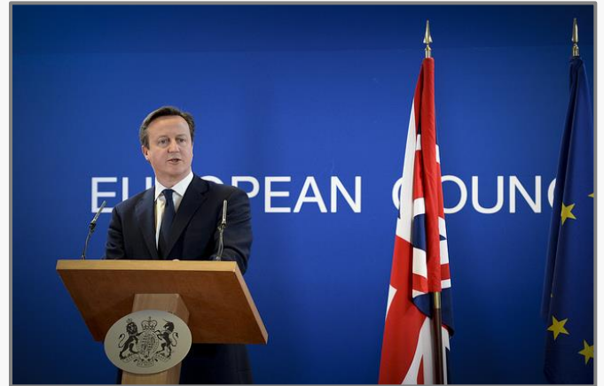
PM at European Council.

Cameron hopes to cut the current high levels of immigration from EU states by reducing access to in-work and out-of-work benefits, including housing subsidies. This reform would benefit the UK by reducing the number of EU migrants, especially coming from Central and Eastern Europe. This last reform has received a great deal of criticism from Central and Eastern European countries as they view the proposition as a form of direct discrimination against their citizens.