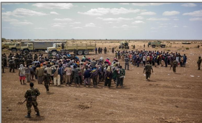
Al Shabaab fighters disengage and lay down arms.

■ North Korean national news agency has reported that the country has developed, and now is in possession, of a hydrogen bomb. Kim Jong-un states that they have become a significant nuclear power and they will use the developments in order to defend their country and independence. The hydrogen bomb is an advanced piece of nuclear technology which is capable of creating more powerful blasts than regular atomic bombs. Kim Jong-un also said that North Korea will continue its development of military forces and weapons.