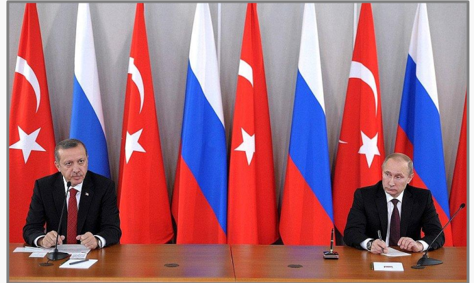
News conference.

Russia is considered Turkey's second largest trading partner and more than 3 million Russian tourists chose Turkey as their travel destination in 2014.