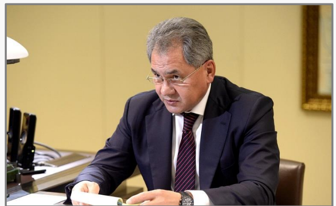
Defence Minister Sergei Shoigu.