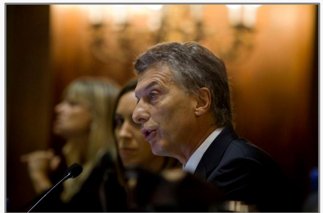
Mauricio Macri.