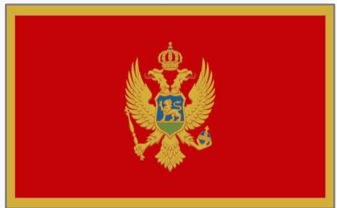
Flag of Montenegro.