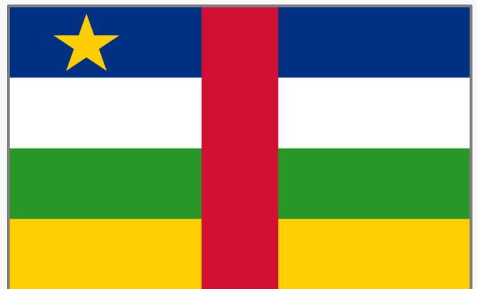
Flag of the Central African Republic.