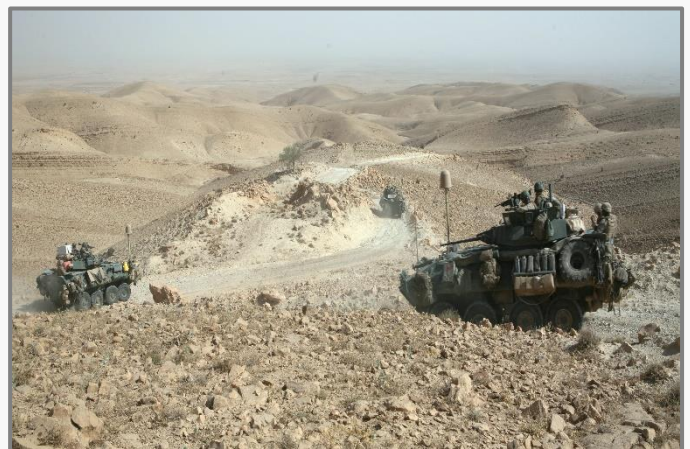
Sinjar.

Yazidis are seen by ISIS as 'devil worshippers' and more than two thousand still remain in captivity by ISIS. Yazidis of all ages joined the Kurds and Peshmerga fighters in the battle to capture Sinjar. Many Yazidis are highly motivated to fight in order to seek revenge for the violent crimes committed by ISIS. A 65-year old Yazidi man insisted that "even those who don't have weapons should come and bring a stick to beat the enemy."