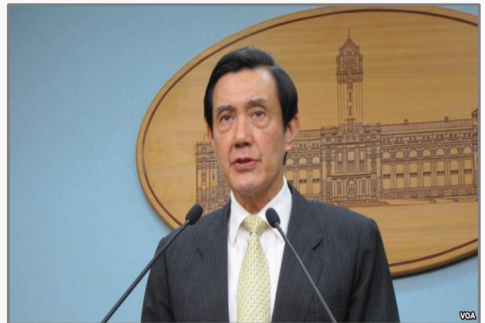
Ma Ying-jeou.