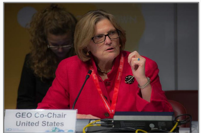
NOAA's Dr. Kathryn D. Sullivan.