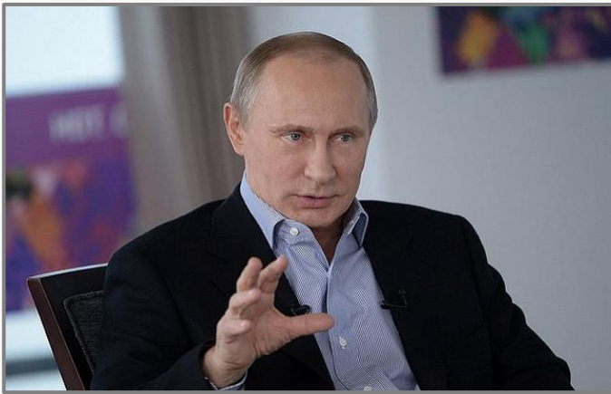
Vladimir Putin.

After the shooting of Russian warplane, Russia sent two helicopters to evacuate the body of the pilot. However the helicopters got ambushed by rebels and one of the helicopters got shot down.