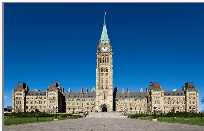
Parliament sits in the Centre Block in Ottawa.

The cabinet of Trudeau consists of people with a wealth of achievements who are experts in their fields. Trudeau has also promised that his government will be more open and transparent than the previous one. Stephen Harper, the former prime minister of Canada, had a history of