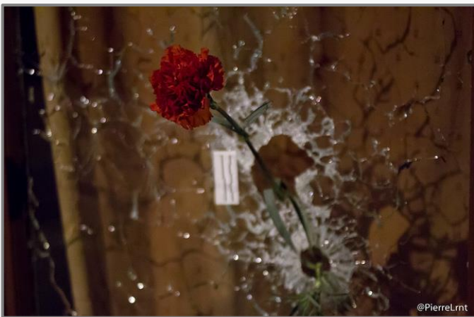
Le Carillon.

The Islamic State claimed responsibility for the attacks and designated Paris as the capital of abomination and perversion and also blamed President Hollande for the airstrikes in Syria and Iraq. Seven attackers died, having been either shot dead by the police or killed by their suicide vests, however not all of them were captured on the night of the incident. Those whose identities have been revealed, were all citizens of the European Union or had recently arrived to the continent. By 16 November, French authorities became focused on a radical jihadist, named Abdelhamid Abaaoud who they believed to have been the leader of the attacks.