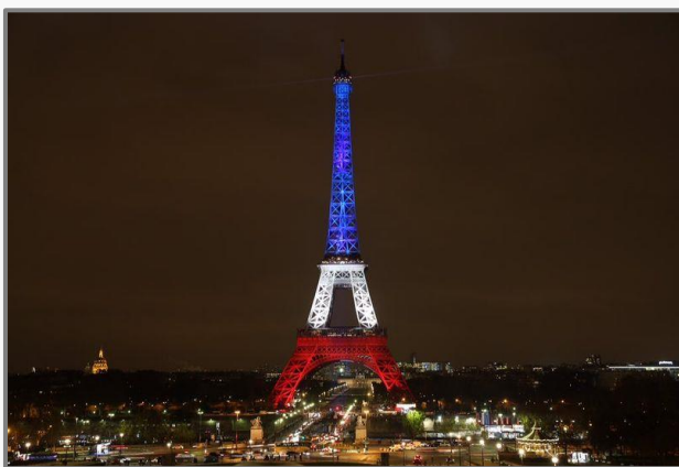
Eiffel Tower illuminated as a memorial to the Paris attacks.

“the fact that the Islamic State was able to paralyse two of the biggest European cities and cause permanent sense of fear, has opened a new chapter in the modern Europe's history”