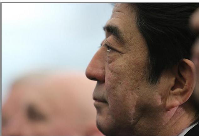
Shinzō Abe.

■ On 18 November, the United States and Cuba reached another milestone in diplomatic relations by signing an environmental agreement under which scientists of the Florida Keys and the Texas Flower Garden Banks national reserves will cooperate on maritime issues with researchers of the Cuban Guanahacabibes National Park and the Banco de San Antonio sanctuary. “We recognize we all share the same ocean and face the same challenges of understanding, managing, and conserving critical marine resources for future generations. [...] The opportunity for international cooperation in marine conservation is invaluable and this moves us closer to ensuring a healthy and productive ocean for everyone” – said Kathryn Sullivan, chief of the US National Oceanic and Atmospheric Administration.