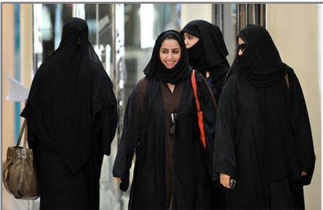
Saudi women in Riyadh.

■ In the light of rising threat from the major anti-government group, backed by the Maldivian Democratic Party, the government of Maldives declared state of emergency limited to 30 days to ensure the citizen's safety and to protect national security. This event added to the already occurred political instability in Maldives which can create more tensions between the government and the opposition. The state of emergency was declared due to the reason that there are threats of violence stemming from the opposition. The opposition demanded that the government release their leader, Mohamed Nasheed, from jail after his arrest related to the anti-terror laws. Mohamed Nasheed is viewed, by the opposition, as the first democratically elected leader of Maldives.