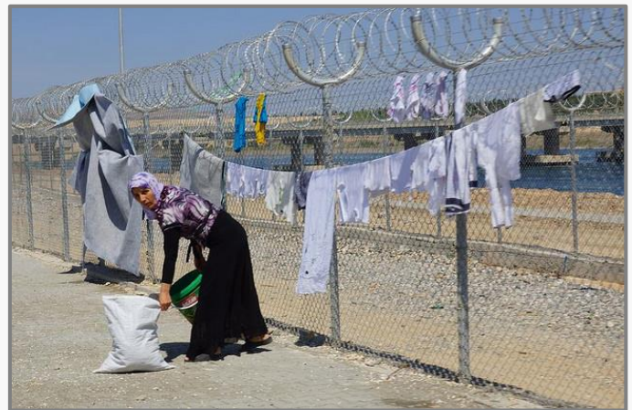
Syrian refugee women in Turkey increasingly vulnerable.

The problem refugees currently face in Turkey is not only the lack of benefits they receive from Turkish government, but also the inability to integrate. They find it hard to live due to the restrictions of them to work. The refugees cannot work legally in Turkey without working permits. Since they can only get the status of “temporary protection” and not the refugee status, they cannot apply for the working permits. However, Turkish government is considering on granting some refugees working permits with a government research project working on identifying their skills and assessing what gaps in the labour market they could fill.