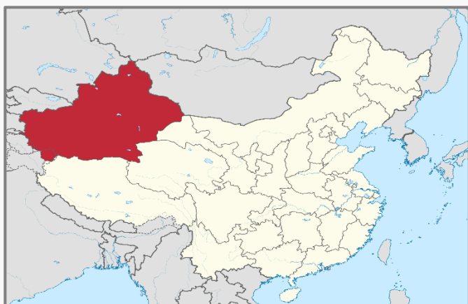
Map showing the location of Xinjiang.

■ Chinese security forces have killed 28 people in the country's western region, Xinjiang. According to government officials, the victims were part of a terrorist group that had carried out a deadly attack on a coal mine in September. 16 people had been killed then, including 5 police officers and another 18 had been wounded. Chinese authorities undertook a manhunt which involved killing the 28 alleged terrorist. According to human rights groups, Beijing has never presented any convincing evidence of the existence of such a terrorist group in the region. They even state that much of the unrest is caused by the frustration over government control on culture and religion issues of Uighur people who form majority in Xinjiang.