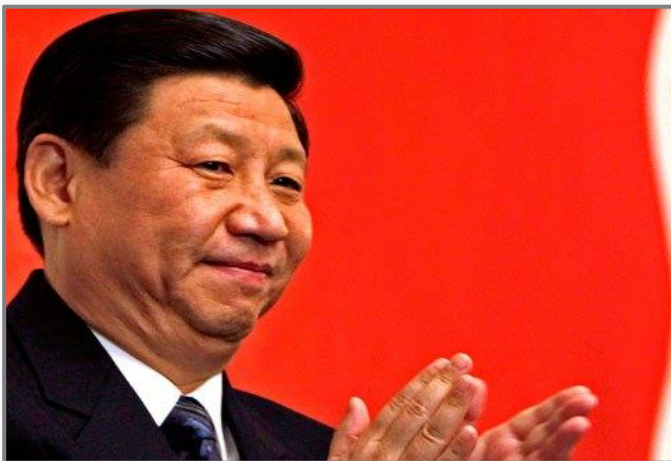
Xi Jinping.

“a formal declaration of independence by Taiwan could lead to military intervention”