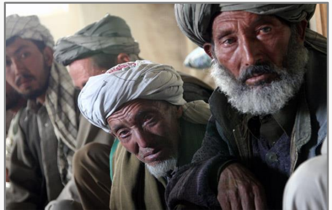
Hazaras in Behsud.