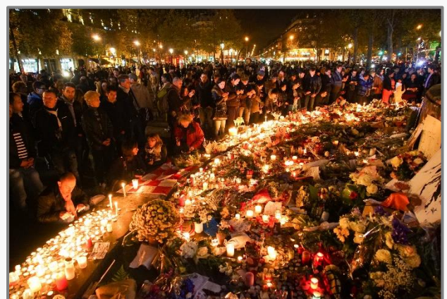
Dozens of mourning people captured during remembrance of Paris attacks victims.