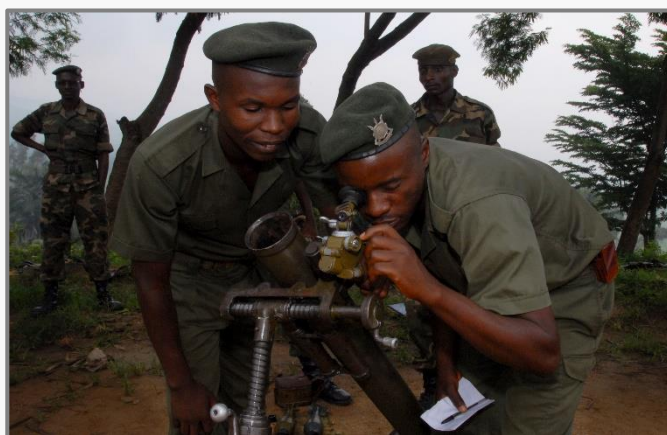
Burundi peacekeepers.