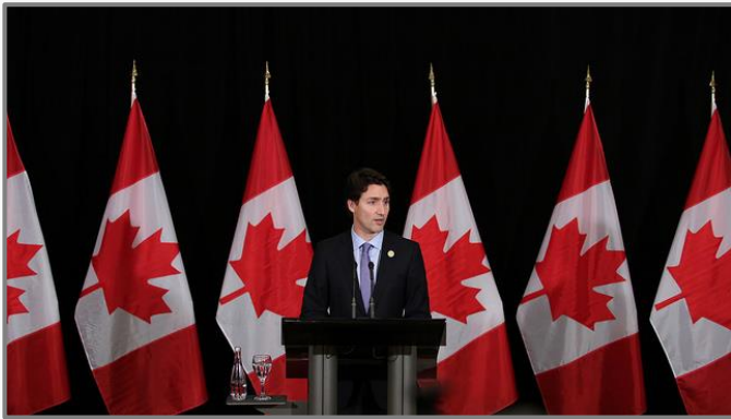
Prime minister Justin Trudeau.

The newly-elected Canadian Prime Minister, Justin Trudeau, has been praised during his first few days of his leadership. Trudeau's decision to bring equality into his cabinet with an equal number of 15 men and 15 women positioned as ministers has been warmly welcomed by the public. Justin Trudeau also showed diversity in his cabinet by having ministers with different ethnic backgrounds. As the second-youngest prime minister in the history of Canada, the aim of creating a very gender-equal and diverse cabinet was to create a better government for Canada. Trudeau chose people for his cabinet based on their backgrounds, achievements and competences.