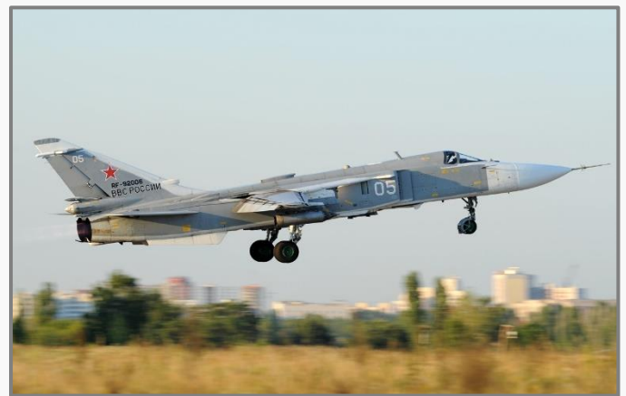
Sukhoi Su-24M2.

Russian President Vladimir Putin replied by arguing that the reasons given by Turkey sounded like weak excuses and dismissed the claims that it was the warplane's fault. Putin said that they gave information beforehand about the warplane: its purpose, whereabouts and intended route. Putin was appalled by the Turk's decision to shoot down the warplane. He argued that the Russian warplane neither threatened the territory of Turkey nor did it violate any airspace regulation.