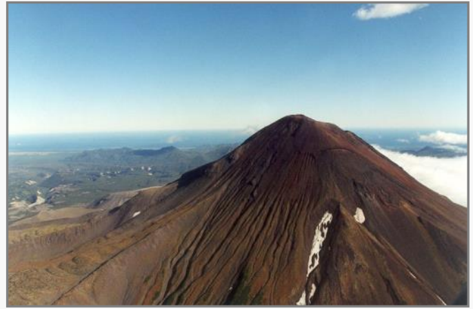
A volcano in the Kuril Islands, Russia.

During the meeting on 19 August the delegates agreed to set up further negotiations via diplomatic channels and decided to strengthen the economic and trade cooperation between the two countries. The next round of talks can be held in a few months.