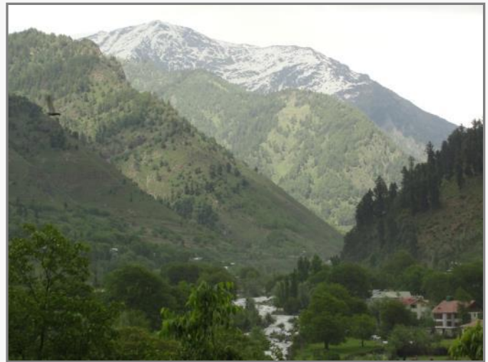
Mountains in Kashmir, India.

In its initial statement, the ministry of Indian Defence Minister A. K. Antony directly accused the Pakistani army of jointly carrying out the attack with militants. Soon after, this allegation was withdrawn as it could have deepened the state of conflict between the rivals. Antony then said to the parliament that "the ambush was carried out by approximately 20 heavily armed terrorists along with persons dressed in