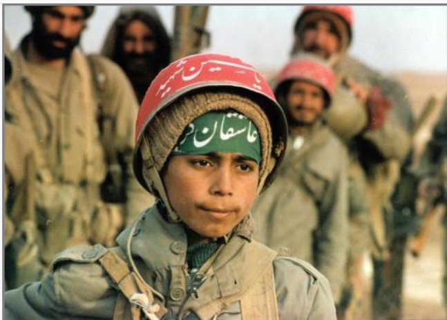
Iranian volunteer child soldier in the Iran-Iraq-war

■ The use of chemical weapons in the attack on Syrian civilians in the end of August was profoundly condemned by international community, mainly by the US. However, recently discovered materials have showed the opposite attitude the US had to the use of chemical weapons in Iran-Iraq war. On the basis of CIA documents, the US was aware of the fact Iraq was using chemical weapons in the mentioned military conflict, but did not take any steps to prevent it either, on the contrary, it latently supported it to achieve its own political goals.