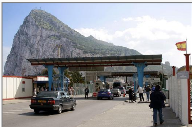
Border between Spain and Gibraltar.

Three hundred years after Gibraltar was ceded by Spain to the UK under the terms of the Utrecht Treaty in 1713, tensions seem to have reborn between the two countries over what started to be a minor disagreement over an artificial reef and disputable border checks – the debate, however, eventually led to a more problematic issue: where does Gibraltar rightfully belong?