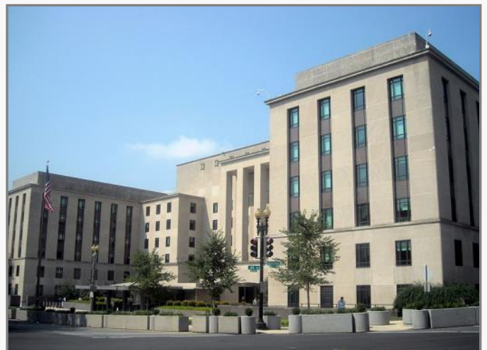
Headquarters of the United States Department of State.

extremely vigilant. Also French and German embassies in Yemen remained closed for few days due to terrorism alert. The warnings regarding safety of Western civilians in the Middle East and North Africa likewise touched the Canadian High Mission in Dhaka which was closed for one day on Sunday 4th August. It reopened its door on Monday after one-day security shutdown.