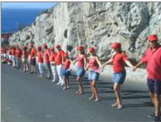
Gibraltarians encircle the Rock holding hands to celebrate the tercentenary

Many experts and independent writers suggest that the tiff between Spain and the UK is a well-staged decoy for their governments to ramp up fake patriotism while they remain servants of Chicago-school economics. Meanwhile, Gibraltar stays ready to continue its role as one of the World’s most favoured places of shady activities.