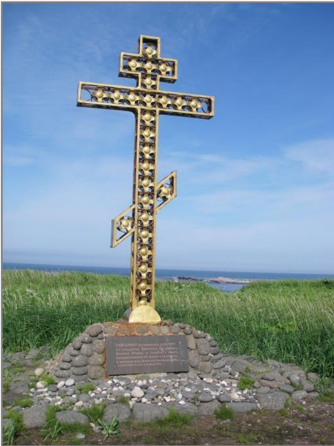
Monument to those who enlarged Russia's territory with the Kuril Islands.

For more than 68 years basically nothing happened that could lead to any kind of solution. The first try happened in 1955, but it was rather a symbolical step from both sides. From the fall of the Soviet Union more and more steps were taken, mostly in the form of principles. In the recent years the solution of the dispute has started to