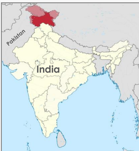
Jammu and Kashmir in India (de facto and disputed areas)

Pakistan states that the accusations are false, denying there having been an exchange of fire along the border in Kashmir. The Pakistani Foreign Ministry, calling the allegations "baseless", said it was looking forward to begin talks soon. "Pakistan is committed to a constructive, sustained and result-oriented process of engagement with India and looks forward to an early resumption of the dialogue process", the ministry said in a statement. The peace talks were called off by India in January, after two of its soldiers were killed in an armed clash along the border.