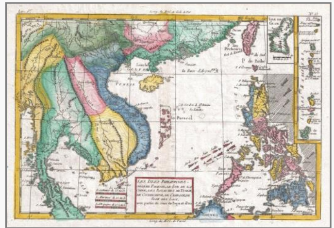
A map from 1780 shows the Paracel Islands on the South China Sea

Back in 2002, the ASEAN member states signed a non-binding declaration about using peaceful measures when approaching sovereign disputes in the South China Sea. Six of the signatories – China, Taiwan, Brunei, Malaysia, the Philippines and Vietnam – have entire or