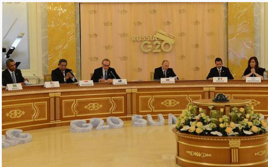
First meeting at 2013 G-20 Saint Petersburg summit. From the left to the right: Barack Obama, Susilo Bambang Yudhoyono, Bob Carr, Vladimir Putin, Enrique Peña Nieto and Cristina Fernández de Kirchner.

■ The US-Russia political and diplomatic relations became even more fragile after Russian President Vladimir Putin decided to grant an ad interim political asylum to the American NSA leaker Edward Snowden. The White House considered the act of Kremlin highly provocative and very disappointing. Obama concluded that the political atmosphere between two states is not appropriate for leading bilateral talks as the tensions are still growing and cancelled the meeting with the Russian President. However, he will attend the G20 talks in St. Petersburg.