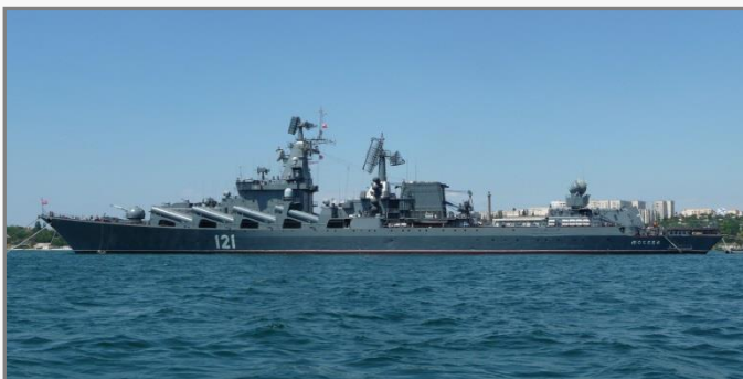
"Moskva" - guided missile cruiser of the Russian Navy in the Black Sea, Sevastopol bay.

■ Russia surprised the international community by launching war games in the Black Sea without prior notice. Vladimir Putin ordered large-scale air and naval maneuvers to be performed. NATO pointed out the need for partners to notify each other when planning to launch war games, but in this case Russia was not obliged to do that. Meanwhile, Putin also announced the plan to gradually increase the number of soldiers in the Russian army, drafting more than 150,000 men into the armed forces until the 15th of July this year. Putin plans to pump up the number of contract servicemen to 240,000 by the end of 2013.