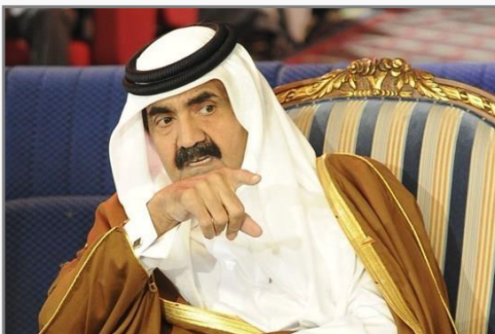
Sheik Hamad bin Khalifa al-Thani.

■ Hamid Karzai, the president of Afghanistan travelled to Doha to meet Qatari emir Hamad bin Khalifa Al Thani and Prime Minister Hamad bin Jassem Al Thani. "Issues of mutual interest" were discussed, including opening an office for the Taliban in Doha. Even though the circumstances are already set for peace talks, the Taliban still refuse to negotiate with Karzai, who demands the Taliban to break all ties with the al-Qaeda and give up violence. Taliban spokesman Zabiullah Mujahid said: "The opening of the Taliban office in Qatar is not related to Karzai, it is a matter between the Taliban and the Qatar government."