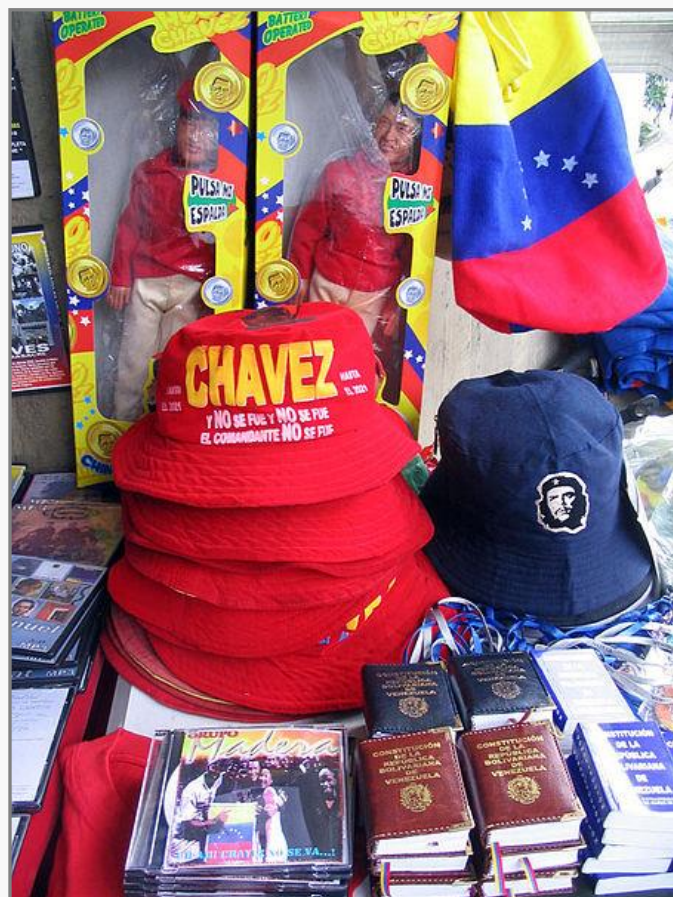
Commercial products about Chavez.

The funeral was held three days after his death where hundreds of thousands of people were present. From all over the world 33 leaders, including Cuba’s Raul Castro, Bolivia’s Evo Morales, Argentina’s