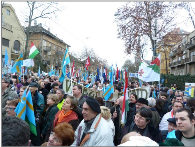
Demonstration for autonomy on the Day of Székely Freedom.

Demonstrations for Székely autonomy were held in Hungary as well as in major European and American cities on the 10th of March. Székelyland which have majority Hungarian population sits in three Romanian counties - Harghita, Covasna and Târgu Mures.