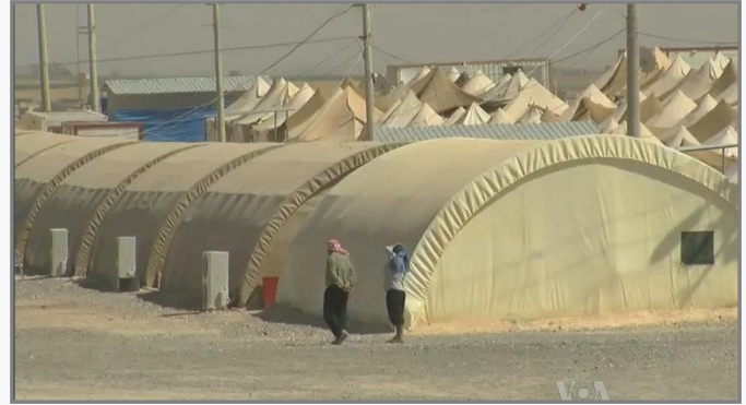
Syrian refugee center on the Turkish border.

Everywhere in the region, food, fuel and rental prices are rising quickly, with a direct impact on local economies. These countries should not only be congratulated for keeping their borders open, but financially supported as well. Regional stability is at stake. In this regards, the situation and its possible solution should be dealt carefully to avoid further killings of the innocent civilians, the concern of the refugees in neighboring countries, possible