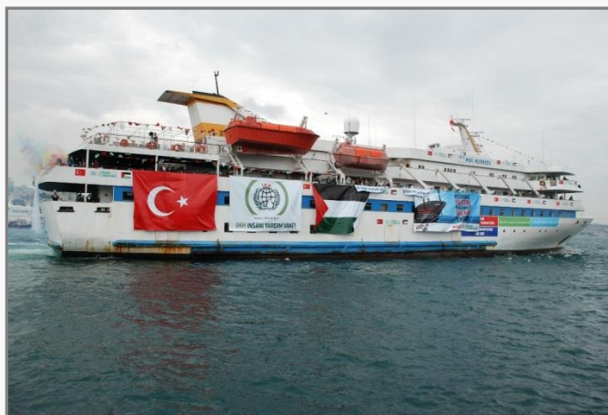
The Mavi Marmara vessel in May 2010.

■ Benjamin Netanyahu has apologised to Turkey for the commando raid that was carried out in May 2010 against a Turkish-led international aid flotilla trying to breach the Gaza blockade. The attack claimed the lives of nine activists. The incident led to an international scandal and it has soured the relations between the two nations. Now, at the end of March Netanyahu expressed regret over injuries and loss of lives, and agreed to compensate the families of the victims. Recep Tayyip Erdogan accepted the apology "in the name of Turkish people".