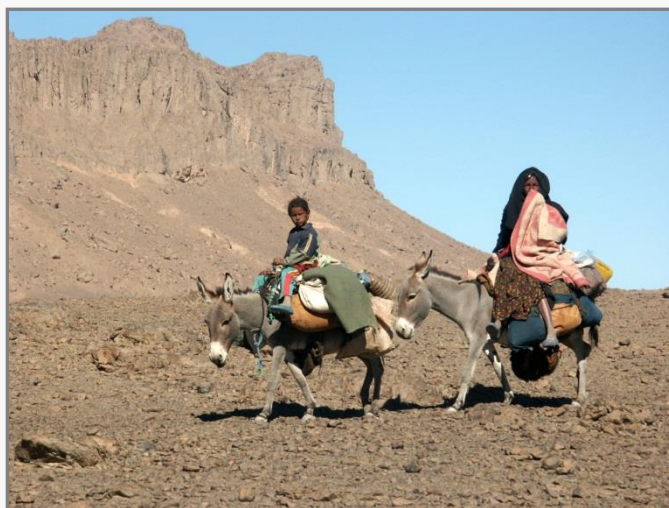
Tuareg nomads in the south of Algeria.

feared leaders of AQIM. He is believed to be the commander behind many actions of taking European tourists as hostage in order to raise money for AQIM's operations. Mokhtar Belmokhtar, the other al-Qaeda commander killed only some days later is said to be the mastermind behind actions such as the hostage-taking at a gas plant in Algeria, this year's January. Analysts say that the action was a message aimed at the West, showing that al-Qaeda is still an alive threat despite the killing of Osama bin Laden. "On Saturday, the 2nd of March, at noon, Chadian armed forces operating in northern Mali completely destroyed a terrorist base" Chad's armed forces reported. Belmokhtar is likely to be among the dead.