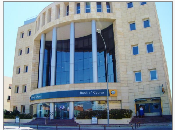
Bank of Cyprus offices in Nicosia.

working to cut the levy on small depositors to 3% or less ahead of a crucial parliamentary vote, which was delayed some days. It was also agreed that Cyprus' banks would stay closed until the decision will be carried out. Germany applauded the Cypriot deal, but Russian President Vladimir Putin called a proposed tax in Cyprus on bank deposits "unfair, unprofessional and dangerous".