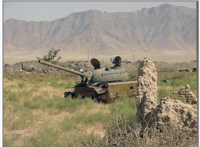
An abandoned Russian T-55B Tank lies in ruin in a spot near Bagram.

Meanwhile, Australian Defence Minister Stephen Smith has come to the decision of shutting down the main Australian military camp in Afghanistan until the end of this