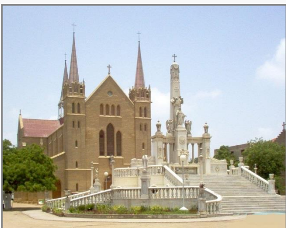
The St. Patrick's Cathedral in Karachi