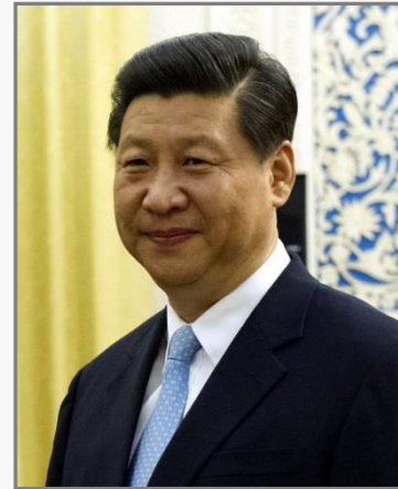
President Xi Jinping

Russia, India, China and South Africa. These countries decided to establish a joint bank which can be a rival for World Bank and IMF. President Xi and Jacob Zuma, President of South Africa negotiated about bilateral ties in agriculture and industry.