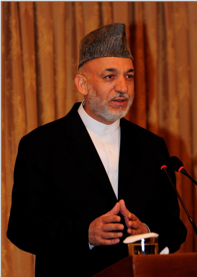
Hamid Karzai.

United States Secretary of State John Kerry visited Afghanistan on the 25th of March to meet President Hamid Karzai in order to discuss recent points of political strain. Several topics of mutual interest have been discussed, such as Karzai's worries about America's respect towards the sovereignty of Afghanistan. In a news conference in Kabul, Kerry said that both the US and Afghanistan were "on the same page"