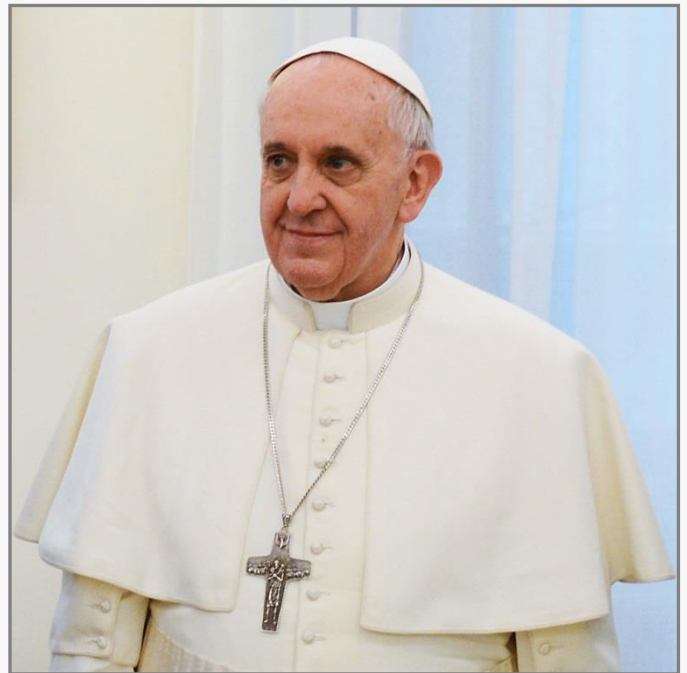
Pope Francis.

On the first Election Day the 115 elector cardinals took their oath placing their hands on the Gospel in the Sistine Chapel. After this who did not belong to the Conclave were locked out from the