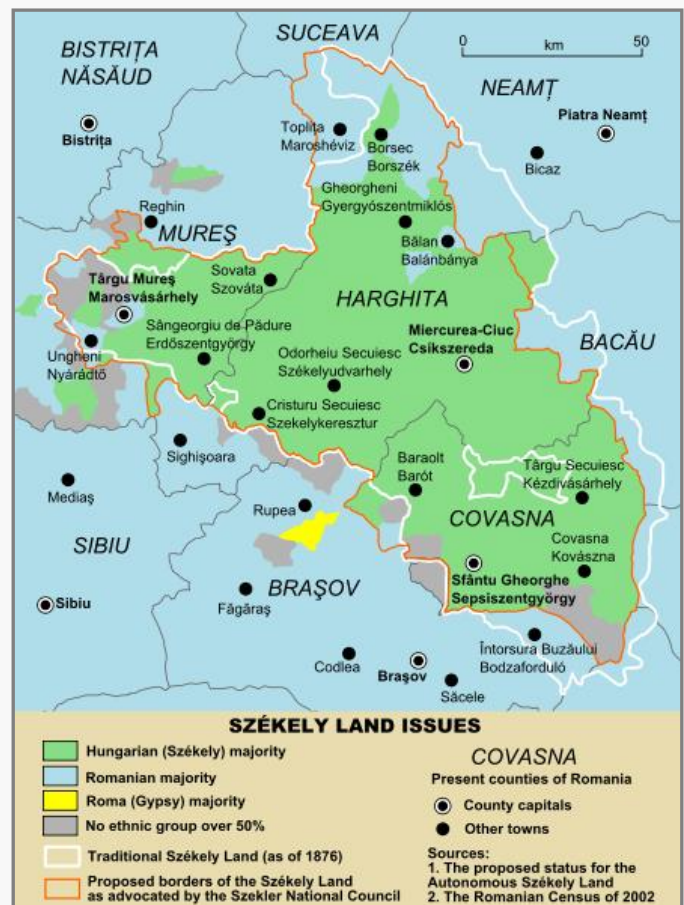
Ethnic map of Székelyland

from medieval times, the first official reference dates back to the 13th century. Along with Transylvania, it became part of Romania after World War I. In December 1918 at the Romanian Assembly of Gyulafehérvár (Alba Iulia), Romanian delegates from throughout Transylvania voted in favour to join the Kingdom of Romania. This move was later internationally recognized in 1920 with the Treaty of Trianon. Between 1952 and 1968, for a short time, Székelyland retrieved its apparent autonomy. After the fall of communism many people hoped that the autonomy would soon be restored again, however – despite new autonomy initiatives – this has not happened yet.