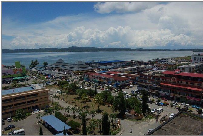
Lahad Datu town and sea view

government with his concerns. He said that by battling Malaysia the Sulu not only risk their lives but can also cause problems to the Filipino families living and working there. Aquino reminded Kiram that as a Filipino citizen the Constitution applies to him and his people, and in this constitution provoking war is a crime. The 74-year-old sultan said he was ready to be jailed. Kiram emphasized the need to come up with a diplomatic, win-win solution, but said he would not withdraw from Sabah.