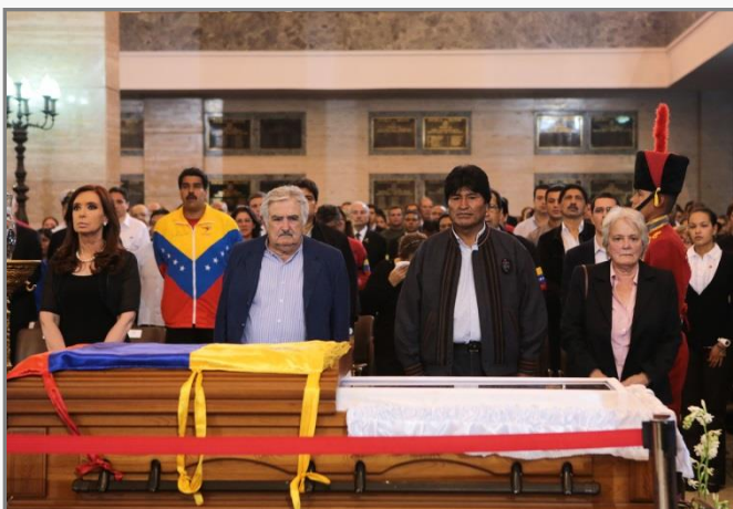
Argentina's President Cristina Fernandez, Venezuela's interim President Nicolas Maduro, Uruguay's President Jose Mujica and Bolivia's President Evo Morales.

Many leaders sent their condolence after the statement. His death had the hugest impact on his loyal allies: Cuba, Bolivia and Ecuador. In Cuba the government declared a three day of national mourning for the leader who was like a son to Fidel Castro. Evo Morales, President of Columbia, said that "Chavez is more alive than ever" and that his presence will influence this region and the whole world in the future as well. In the statement of the Ecuadorian government they expressed their hope that the countries in South-America would carry on Chavez's revolution. Vitaly Churkin, Russia's Ambassador to the United Nations said that Chavez was a great politician not just for his country, but for the whole world. William Hague, foreign minister of the United Kingdom said that Chavez had left a "lasting impression" on Venezuela. Barack Obama stated that these are