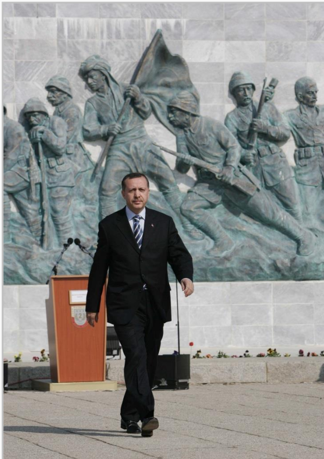
Turkish Prime Minister, Recep Tayyip Erdogan.

Abdullah Öcalan , the jailed leader of the Kurdish movement in Turkey calls for ceasefire after thirty years of fighting for Kurdish homeland. Since 1984, the conflict has claimed more than 40,000 victims. The PKK (Kurdistan Workers' Party) is now recognised as a terrorist organization by the international community, and its symbols have been banned in Turkey.