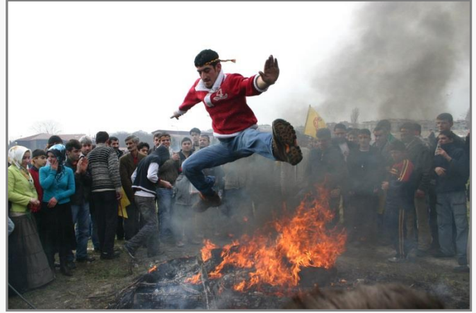
Newroz celebration in Istanbul.

The call for ceasefire was announced during the Kurdish New Year celebrations in Diyarbakir, on the 21st of March. "We have reached the point where weapons should be silent and ideas and politics should speak," Öcalan wrote. He also ordered the fighters of PKK to withdraw from Turkish territories, back to Northern Iraq. Hundreds of thousands of Kurds were present at the celebration to hear the message. The announcement was read out in both Kurdish and Turkish, and was broadcasted live on Turkish television. Öcalan described the forthcoming era as a start to a "different", "democratic struggle". "A new phase in our struggle is beginning. Now a door is opening to a phase where we are moving from armed resistance to an era of democratic political struggle," Öcalan wrote.