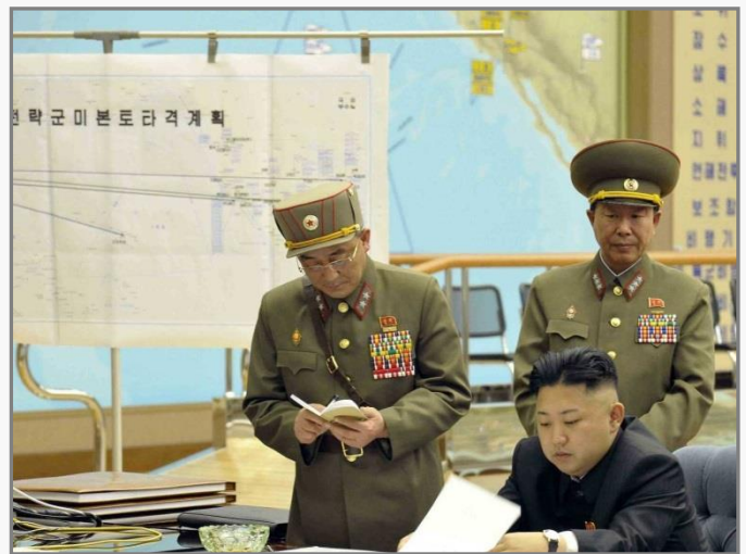
Kim Jong-un.

attacks. Meanwhile China called for both Koreas to calm down and start to continue talking with each other.