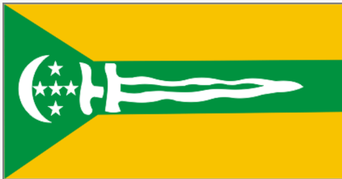
Modern flag of Sultanate of Sulu.

Kiram said that the sultanate declares a unilateral ceasefire and had ordered their troops to take a defensive position. However, Kuala Lumpur is not willing to accept the call. “A unilateral cease-fire is not accepted by Malaysia unless the militants surrender unconditionally” says Defence Minister Ahmad Zahid.