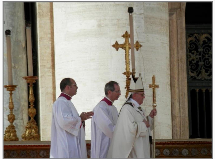
Inauguration of Pope's Francis Ministry, 19 March 2013.

For the world his election was a complete surprise. For example the Italian Conference of Bishops was so sure about that Angelo Scola will be elected that they released a statement – shortly after the white smoke was seen –, In which they were congratulating him becoming the Pope. Few minutes later they corrected this mistake. However the crowd on the St Marc Square did not know who this archbishop was, after his first appearance everybody took him in their heart as he asked for the crowd's blessing and prayers. And of course this was the biggest deal for the 400 million believers throughout Latin-America.