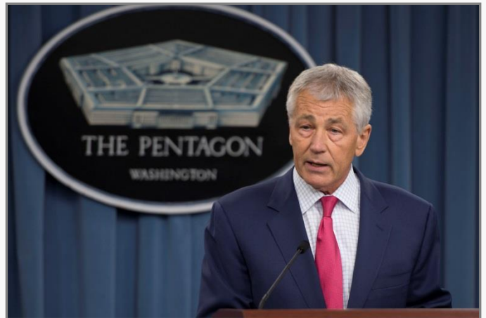
Secretary of Defense Chuck Hagel announces a change in the U.S. missile defense deployment during a Pentagon press briefing on March 15, 2013.

■ The fourth and final phase of the European Phased Adaptive Approach (EPAA) for missile defence has been scrapped by US Defence Secretary Chuck Hagel. The speech was delivered on the 15th of March in the Pentagon, announcing four steps to be taken in order to keep up with the recent nuclear developments of Iran and North Korea. Resources will have to be restructured to complete the new plan, causing the deployment of the missile shield in East Europe to be delayed to at least 2022. The interceptors were to have been installed in Poland to fight medium- and intermediate-range missiles. After the announcement, Hagel emphasized the strong commitment of the US to keep NATO developments in Europe ongoing.