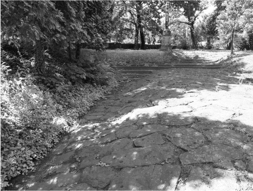
Figure 3. Uneven subsidence of a Roman road in Savaria. This kind of deformation is often caused by seismically induced liquefaction of the subsoil. Szombathely, Roman garden. #2156

There are a few promising initiatives elsewhere in the Carpathian-Pannonian region. A large portion of the Roman city wall in Siscia (modern Sisak in Croatia) lies, collapsed, several meters from the foundation. 48 Damage observed to St. Michael's Church in Cluj-Napoca (in Transylvania, Romania) indicates an earthquake of intensity IX, far larger than anything suspected before. 49 Major subsidence in the floor of the Franciscan monastery at Visegrád indicates that there was a major earthquake, causing liquefaction, at some point between 1513 and 1540. Both the monastery and the adjacent church were ruined. 50 Using numerical techniques to model the process of deformation and damage, we