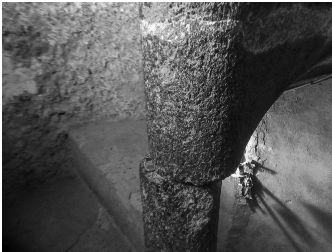
Figure 4. Displaced steps of the spiral staircase in Nagyvázsony donjon. A coin with a diameter of 24 mm for scale. #0376

Preliminary information is given on two sites to show that archaeoseismological research is possible and desirable in Hungary. A Roman road in Savaria (modern Szombathely) shows asymmetric subsidence which may be attributable to seismic activity (Fig. 3): a person or a horse-drawn cart could not move or stand on the 1.5-meter wide tilted edge of the road. This kind of deformation seems a prime example of uneven subsidence caused by seismic-generated liquefaction. A minor trench or a hand boring might reveal sandy subsoil to corroborate the presence of liquefiable sand. Stairs of the spiral staircase from the fifteenth-century donjon in Nagyvázsony were displaced by roughly 4 cm, obviously caused by lateral loading, possibly due to an earthquake (Fig. 4).