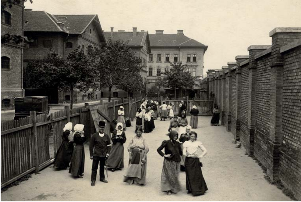
Figure 4. Police officer and women waiting for expulsion from Budapest at the courtyard of the police barrack in Mosonyi Street, 1908.

state police brought in, for which the assembly has already voted to contribute 8,000 krone annually for operating expenses [sic].” 69