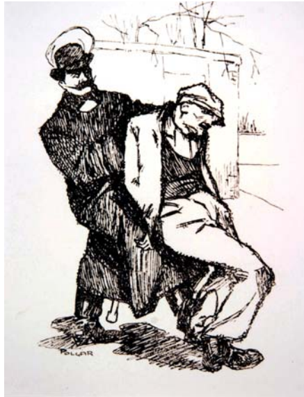
Figure 1. Police officer catching a criminal.

The system described above remained unchanged over subsequent years. Police manuals and guide books published beginning in the 1900s illustrate the unique aspects of the Budapest police's surveillance service. Perhaps the most important of these publications was the 1906 Rendőrközegek tankönyve [Police Officer's Handbook], which offered detailed information regarding the Budapest police's surveillance service. The text book reveals that four police officers were assigned to posts located outside buildings and two police officers were assigned to posts located inside buildings. 9 The book states that police officers were prohibited from engaging in the following activities while on duty: leaving their post without permission, smoking or sleeping at their posts, entering a location requiring police surveillance without reason, partaking in "unwarranted conversation" and