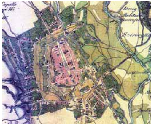
Figure 4. Kassa on the basis of the map-section of the second military survey (1819).