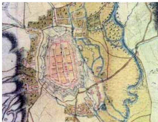
Figure 3. Kassa on the basis of the map-section of the first military survey (1782–1785).

Source: Maps Collection of the Ministry of Defense Museum and Institute of Military History–Arcanum Database. Papers of the First and Second Military Surveys of Abauj County