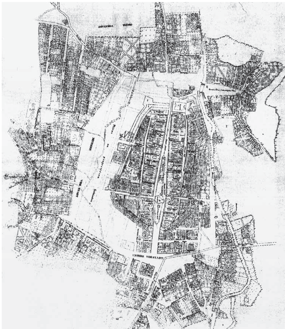
Figure 5. Joseph Ott's map of Kassa, from roughly 1830.

Source: "Plan der königl. Freistadt Kaschau" (Joseph Ott).