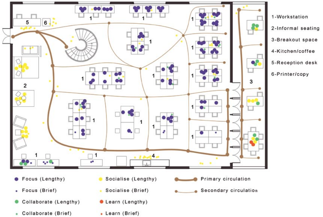
Figure 2. Behavioral map of users' activities at Punspace Tha Phae Gate

From the behavioral maps, spaces with minimal and highest levels of various behaviors were identified to determine the relationship between spatial components and patterns of behaviors. This information made it possible to generate a frequency table of users' activities in the two research sites.