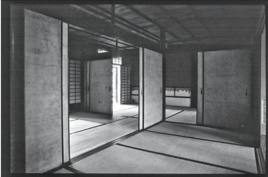
4. Interior of the Shokin-tei in Katsura Rykiu, Kyoto, 17th century. Space flows freely among movable panels without any decoration.