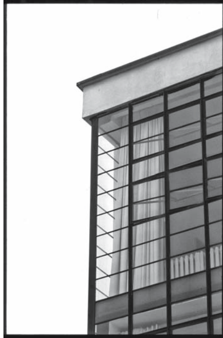
7. Walter Gropius, Detail of the Bauhaus's workshop wing, Dessau, 1925-26. Siegfried Gidion likened the experience of the corner of this building to a cubist painting, with the simultaneous view of an object from different sides.