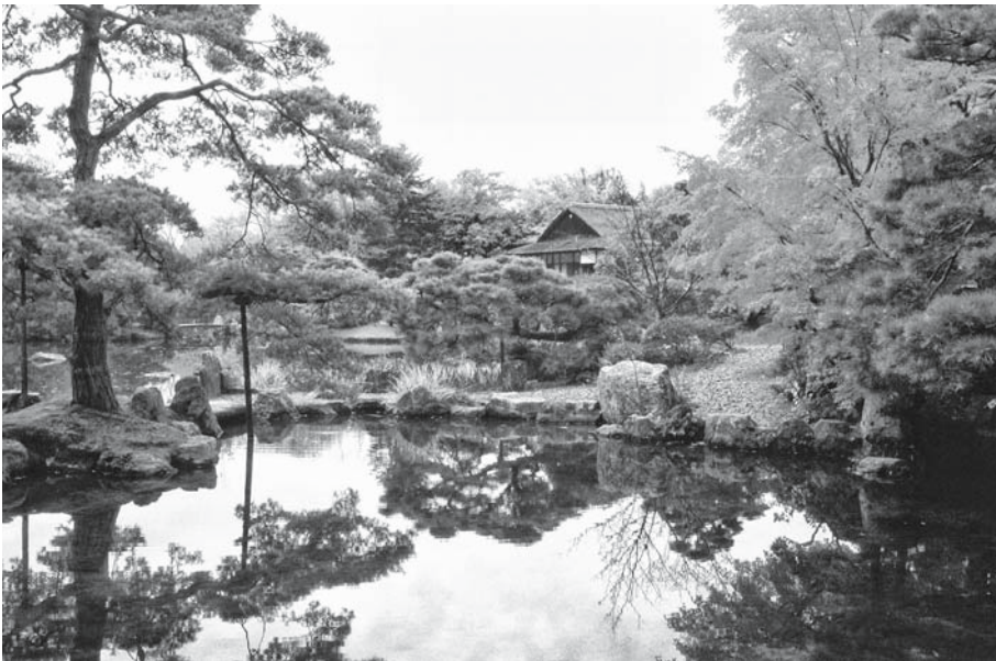
3. The Garden of Villa Katsura, Kyoto, 17th century. The scrolling garden exemplifies permanent change, indeterminism.