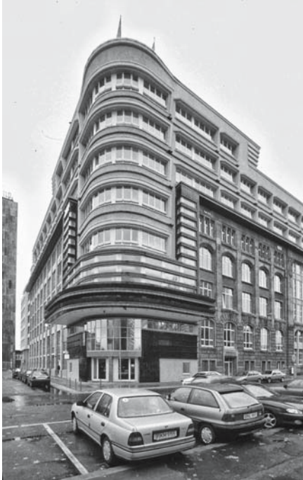
6. Erich Mendelsohn, Mosse-Haus, Berlin, 1921-23. The architect spoke of speed, energy and different experiences of the building depending on whether the beholder walked or drove a car.