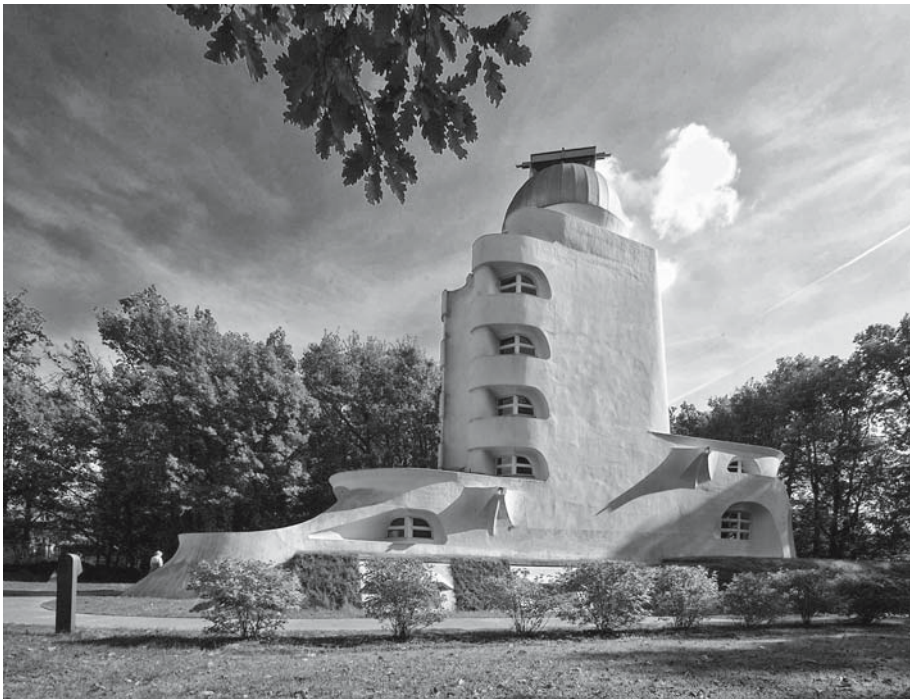
5. Erich Mendelsohn, Einsteinturm, built from 1919 to 1921. The streamlined, organic form corresponds to elements of Einstein's teaching.