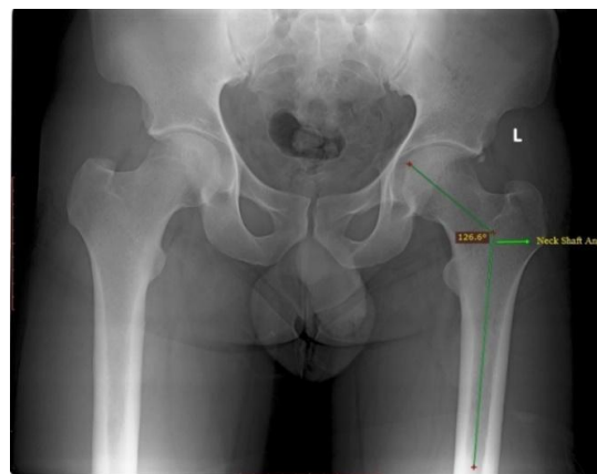
Figure 2. Sagittal X-ray of Hip showing Neck Shaft Angle