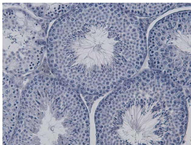
Figure 3. Restoration of normal morphology of the testis to a great extent after chelating therapy with monensin ( 18 \text{ mg kg}^{-1} \text{ b.w.} ) of Cd intoxicated mice ( 20 \text{ mg kg}^{-1} \text{ b.w.} ). HE, x 400.